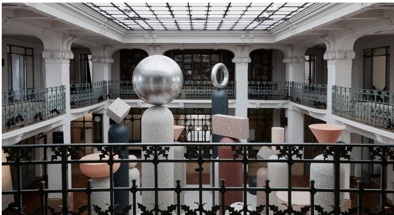
Volume, surface, trajectory and form combine in Formations' main room