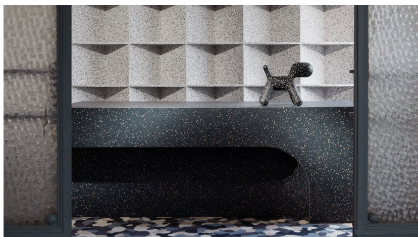
Meeting Room created with Tarkett iQ Surface, Desso carpet and furniture from Magis