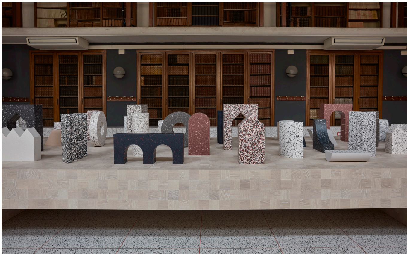
iQ Surface's creativity and possibilities are exemplified in the library