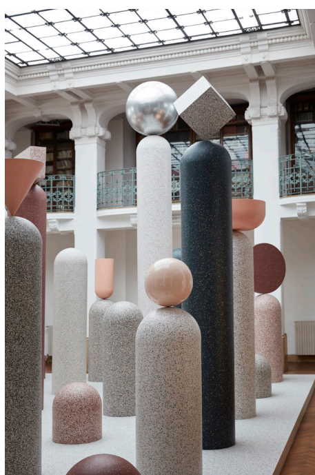
Cones, rings, cubes and spheres adorn the columns of the main installation