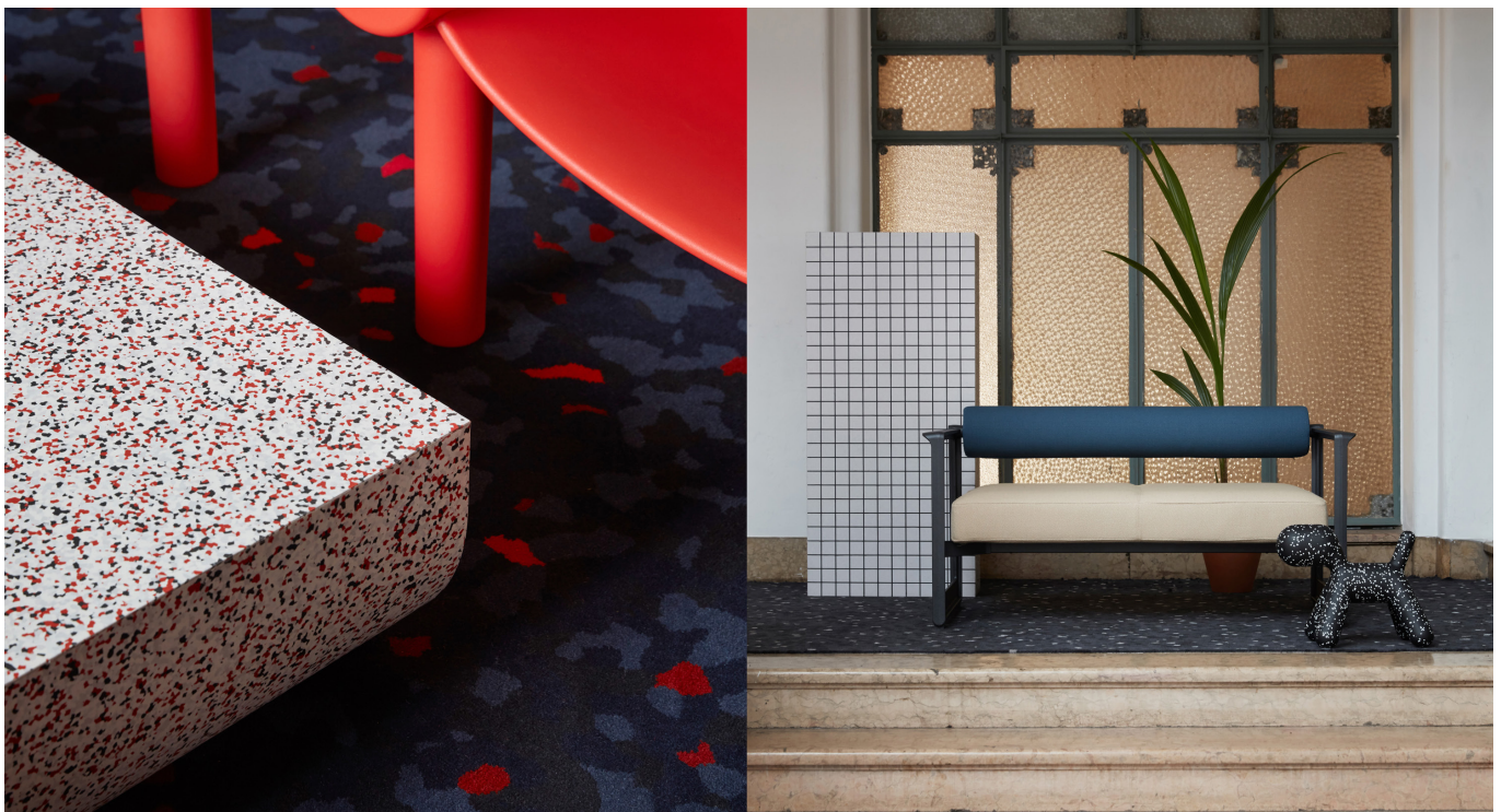
At the center of Formations, a stage showcasing a selection of Magis' timeless iconic pieces provides the perfect viewing point for visitors to sit back and enjoy the installation

Two companies with a shared set of values and a design approach that pushes boundaries and challenges codes, Tarkett have chosen to team up with design brand Magis. A dynamic family-run entrepreneurial business with an industrial culture and a rich heritage of pioneering timeless products, the furniture brand works with a swathe of internationally renowned designers, to create quality collections that showcase highly functional and technological quality products. During Formations, carefully chosen iconic pieces - such as Konstatin Grcic's Brut sofa, with its cylindrical back - echo the archetypal forms of the installation and reflect iQ Surface's colour palette. With such design chemistry, Magis is the perfect pairing for Tarkett to communicate the full potential and beauty of its materials to a broader audience.