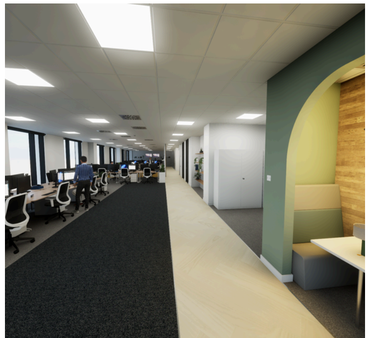
Workplace setting in Tarkett’s VR Human Conscious Design Platform