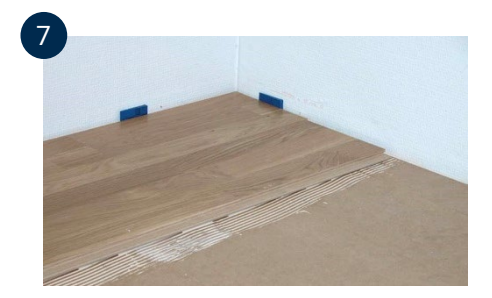
Second board, second row: Carefully place the board close to the short end of the previous board. Fold the board down in a continuous motion while applying light pressure on the short end of the previous board. Make sure that the boards are close together when folding down. Continue to install the floor as described previously.