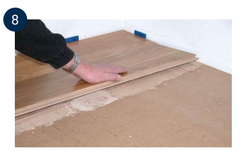
Go back along the board row while pressing the row down against the subflooring (into the glue). Proceed as described in points 6-8.