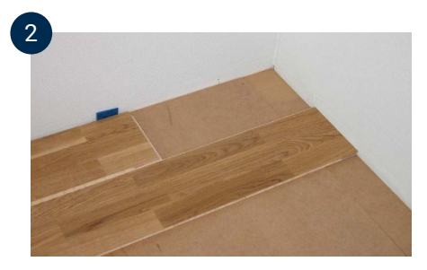
At the end of the row, turn the last board so that tongue lies against tongue. Push the short end tight against the wall.