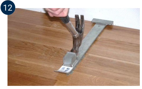
Spread out glue, lay down the last row of boards, and knock them in place using the percussion iron. Wedge against wall.