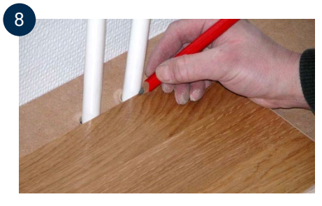
When there's a pipe at the long side of the board: - and how far from the edge of the board drill holes with a diameter of approx. 10 mm larger than the pipe itself. Measure how far from the end of the board the holes should be drilled