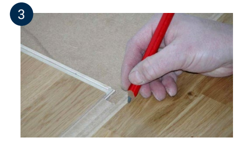
At the end of the row, turn the last board so that groove is against groove. Push the short end tight against the wall. With a pencil, mark the cut 4-5 mm from the short end of the previous board to make it easier to lower the board into place.