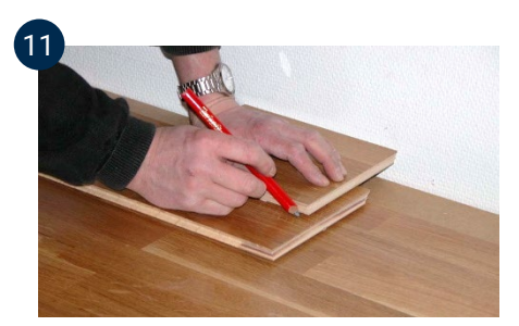
The last row of boards usually needs to be cut lengthwise. Lay the last board with the tongue against the wall, straight across and edge to edge with the penultimate row of boards. Add a piece of scrap board and measure the distance by sliding the board along the wall, while at the same time marking with a pencil where you need to saw the last board.