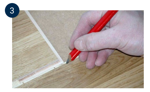
With a pencil, mark the cut 4-5 mm from the short end of the previous board to make it easier to lower the board into place.