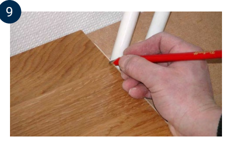
the holes should be