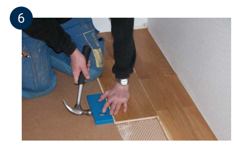
Lay the floor board by board, and put a wedge against the wall. Repeat steps 1-5, starting with the cut-off board. Note that there should be at least 500 mm between end joints across the entire floor. This does not apply to start & stop boards.