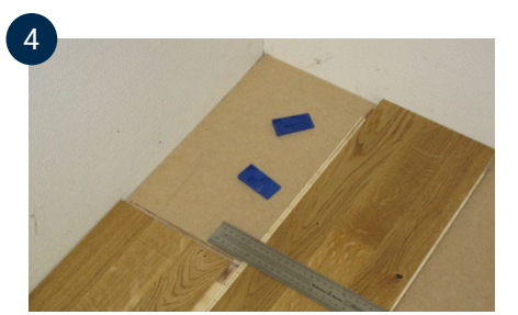
Cut the board to the correct length.