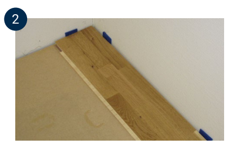
Measure the first row of boards by laying it out without glue.