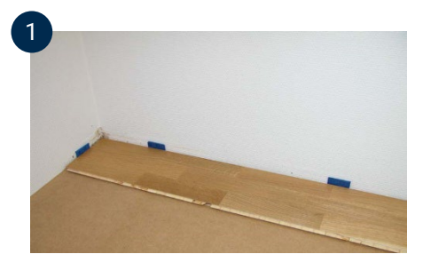
Measure the first row of boards by laying it out without glue.