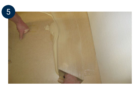
Pick up the board row that has been laid out. Spread glue on the subflooring, corresponding to the entire row of boards. Lay the floor board by board, and put a wedge against the wall.