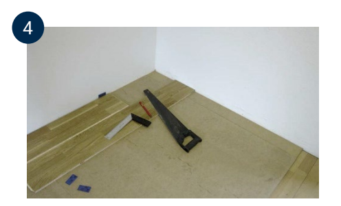
Cut the board to the correct length