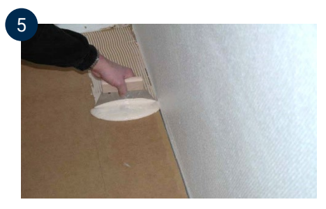
Pick up the board row that has been laid out. Spread glue on the subflooring, corresponding to the entire row of boards.