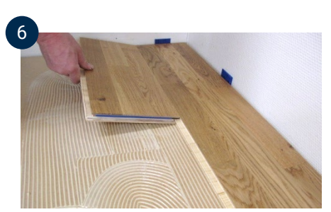
Repeat steps 2-4, pick up and spread glue. Start the second row of boards with the cutoff board from the first row. Get the floor board into place in the groove track and press it down into the glue.