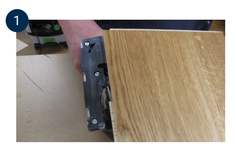
Before installing the first row, the protruding wooden profile on the board's tongue side must first be cut off.