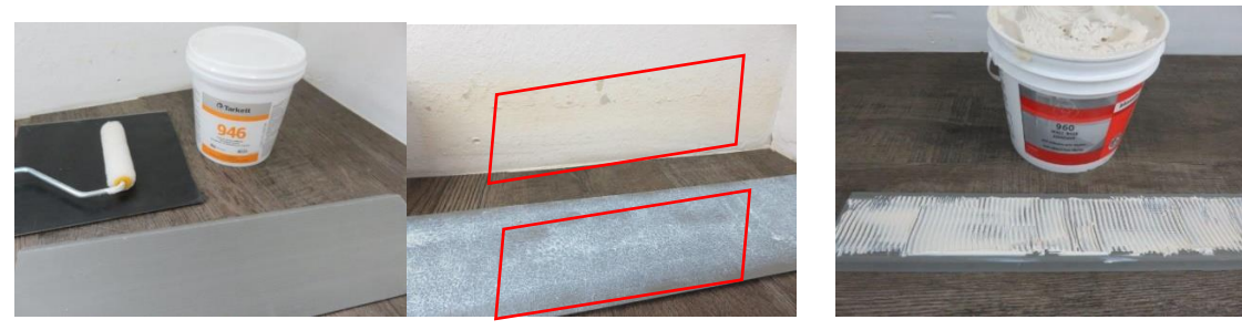
960 Applied only to wall base

946 Applied evenly to both wall surface and wall base