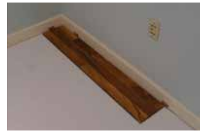
4. Begin laying planks left to right with tongue side against starting wall.