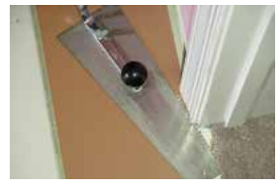
2. Undercut door moldings and casings.