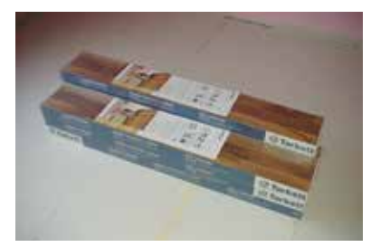
1. Store unopened cartons in room for 48 hours prior to installation.

Scan with SMART PHONE to view installation video