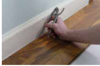
10. Scribe and cut first row, if starting wall is irregular.