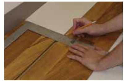
7. Measure and cut last plank in the first row. Allow for 5/16" spacer. Use a pull bar to engage last plank.