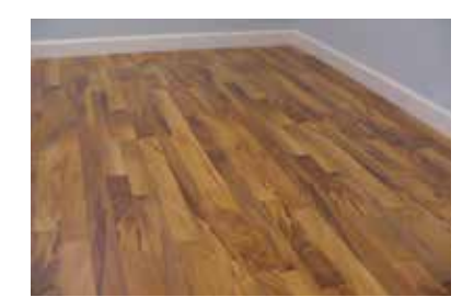
Continue until entire room is complete. Use of T-molding is required for rooms over 40'. Remove spacers and install matching quarter round and moldings.

12. Install second plank by inserting the long side tongue at a low angle into groove side of previous row. Always stagger end joints from row to row a minimum of 12" (30.4cm).