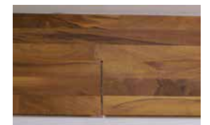
Slide plank toward previous plank. Position approximately 1/4" away from previous plank.