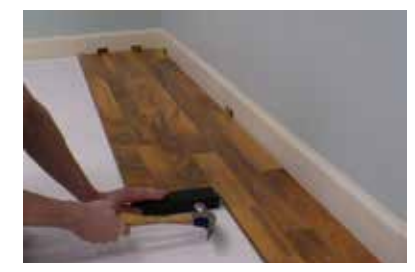
14. Using a hammer and tapping block, gently tap along the groove side to engage planks. Tap center of block.