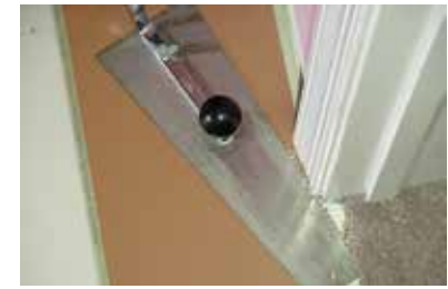
2. Undercut door moldings and casings.