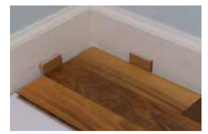
5. Place 5/16" spacers between wall and flooring. Align remaining planks in first row.