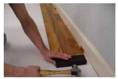
6. Using hammer and tapping block, gently tap along the groove side to engage each plank in first row. Tap in center of block. Continue in this manner to complete first row.