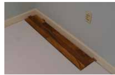
4. Begin laying planks left to right with tongue side against starting wall.