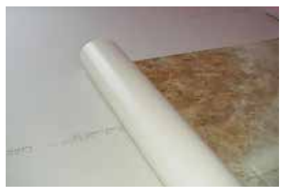
3. Install foam underlayment (Except Malibu and Worthington). When installing over concrete, install an approved vapor retarder prior to installing foam underlayment.