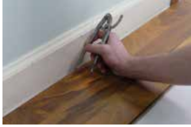
10. Scribe and cut first row, if starting wall is irregular.