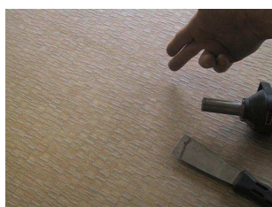
Crease after procedure