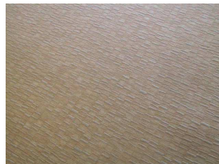
Crease after relax time

After the procedure, the appearance of the crease will lessen. Any remaining crease that is visible will diminish in time.