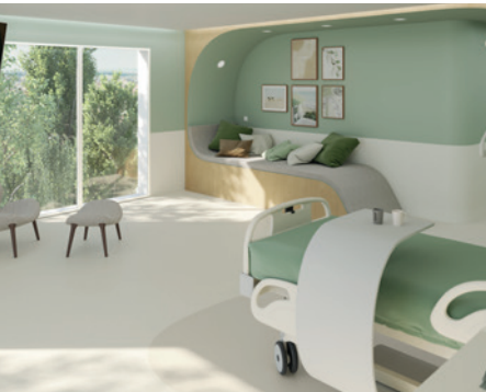
Health & aged care