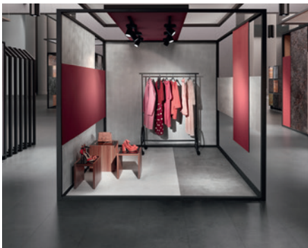
Hospitality and shops