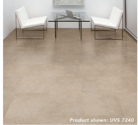
Product shown: UVS 7240

SIZES 12" x 24" (30.48 cm x 60.96 cm) 18" x 18" (45.72 cm x 45.72 cm)