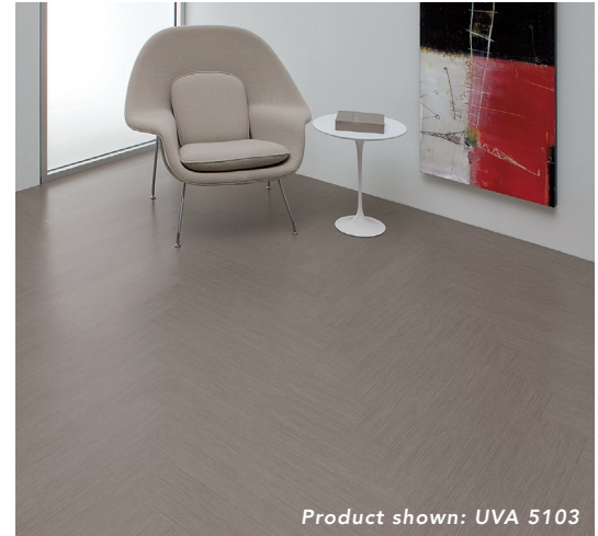
Product shown: UVA 5103