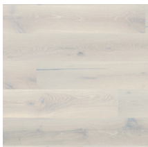
Heritage Oak Opal White