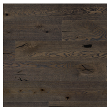
Heritage Oak Old Brown

The pictures only present the colour of the floor. For more details regarding grading and variations see the Grading Book or www.tarkett.com . Tarkett's international range of floors comprises many different products. Some of these may not be for sale in your country. Although every care has been taken to reproduce images that reflect the finished product, the quality of monitor and printer and the nature of wood results in variations in the color and structure of individual planks. When sanding a wooden floor the appearance will change in colour, texture and surface effects.