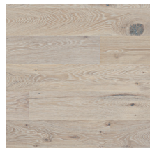
Heritage Oak Lime Stone