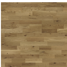
Heritage Oak Classic