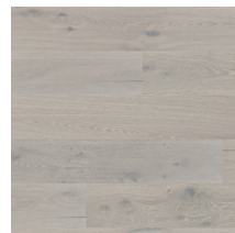
Heritage Oak Urban Grey