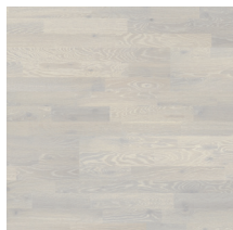
Heritage Oak Chalk White