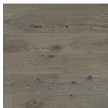
Heritage Oak Old Grey