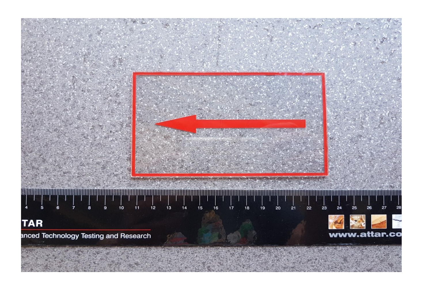
Figure 1: Acczent Ruby 70 vinyl tile.