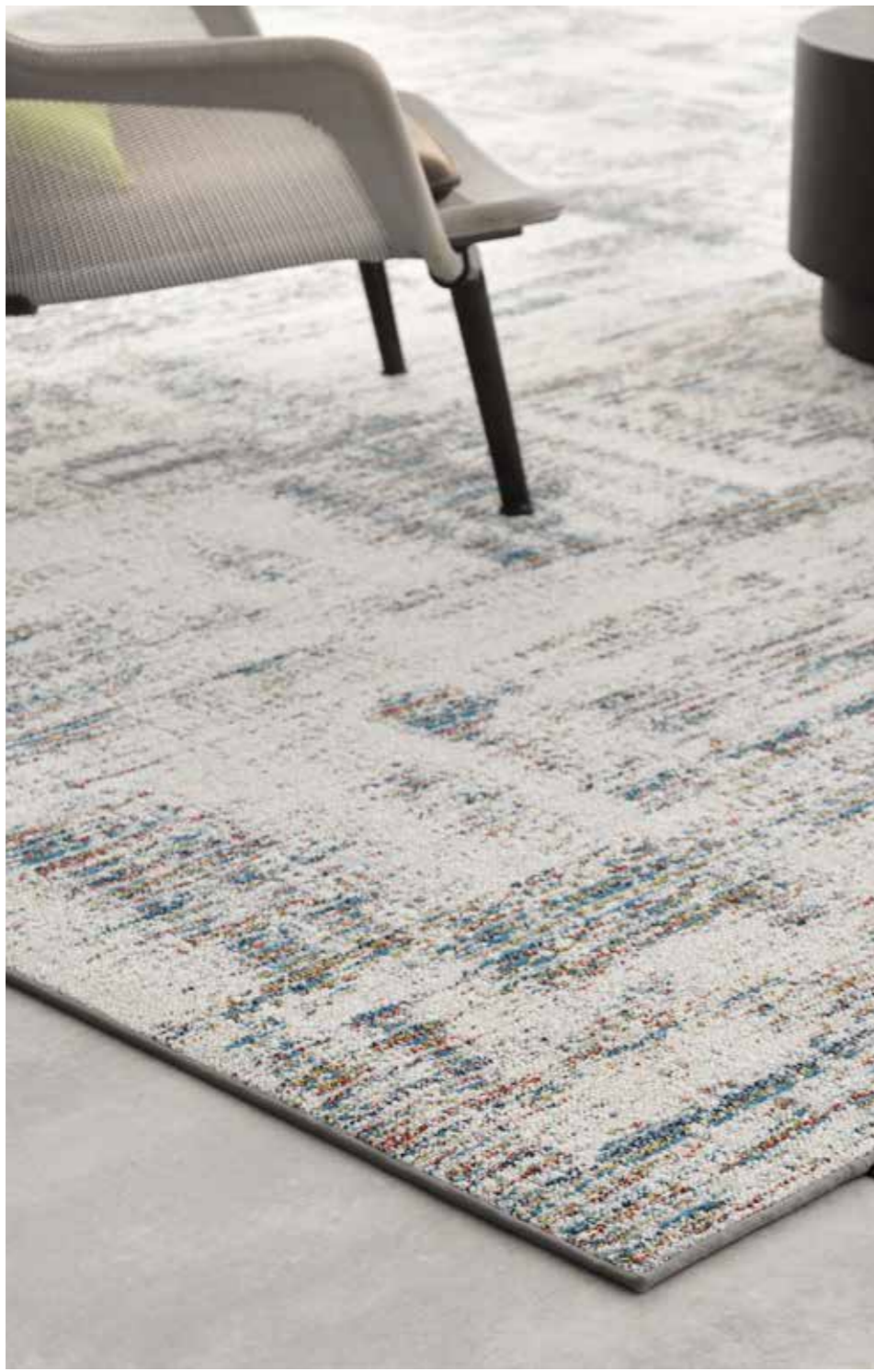
Futurity rug 1324 with cotton blind band B-114, iD Revolution Composite stone grey