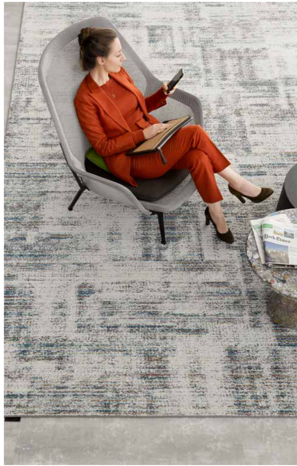
Futurity rug 1324 with cotton blind band B-114, iD Revolution Composite stone grey