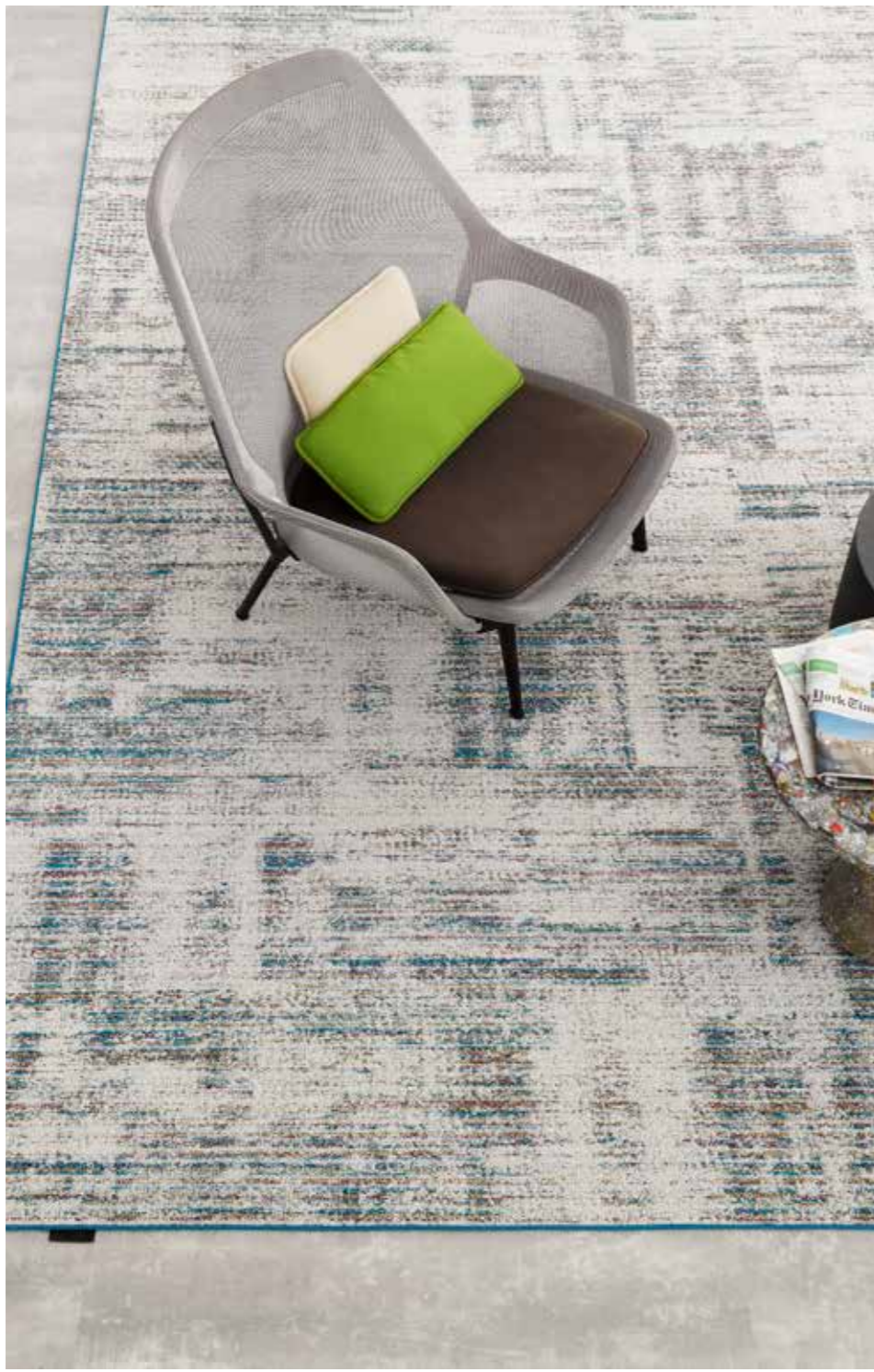
Futurity rug 1324 with cotton blind band B-108, iD Revolution Composite stone grey