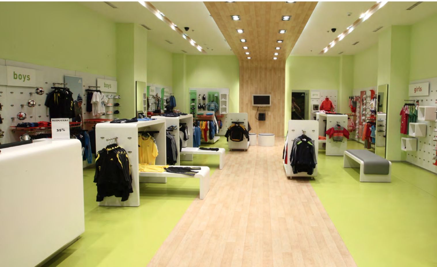
ADIDAS, Bucharest, Romania, Vinyl – Tapiflex Excellence