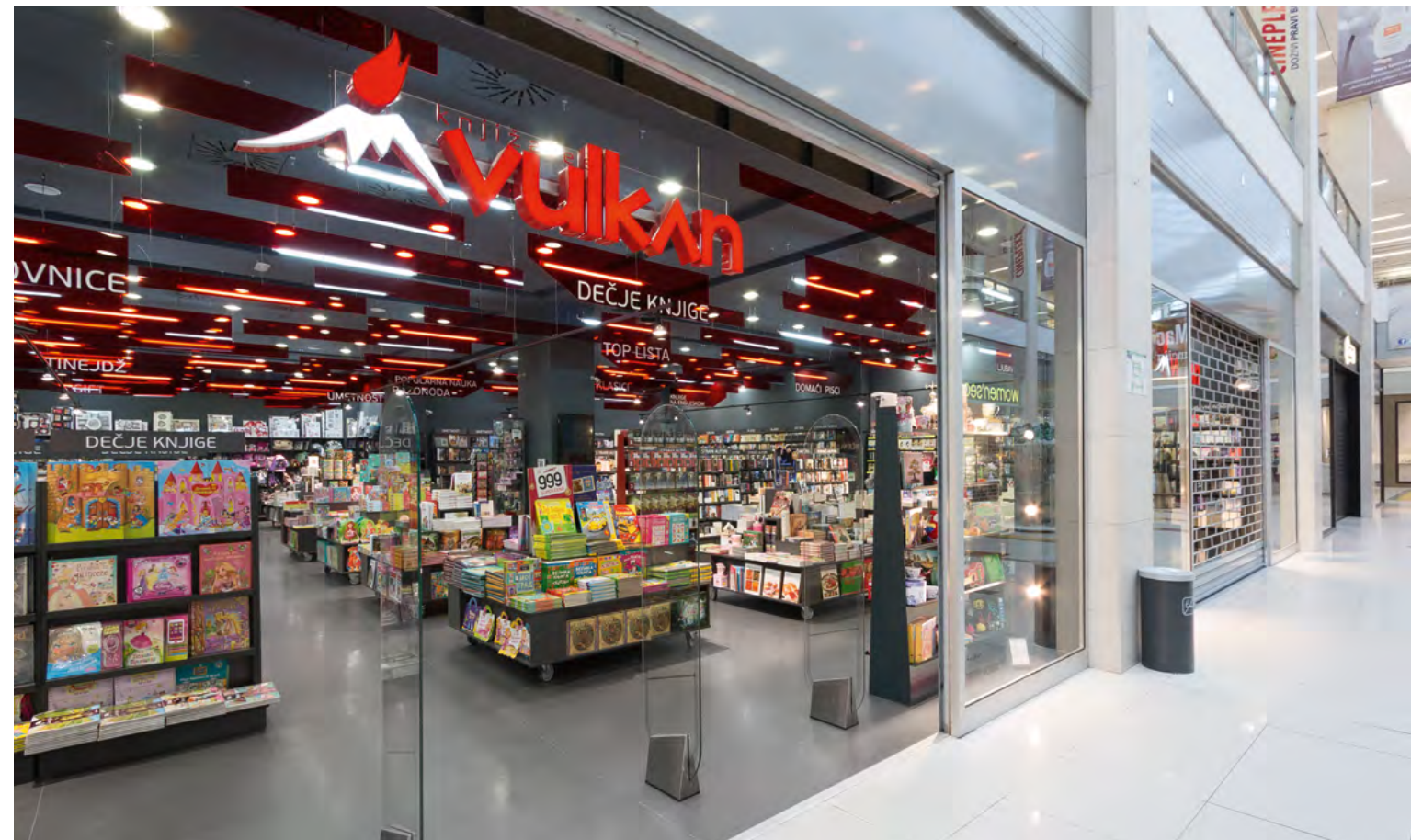
VULKAN, Belgrade, Serbia, Vinyl – Prizma