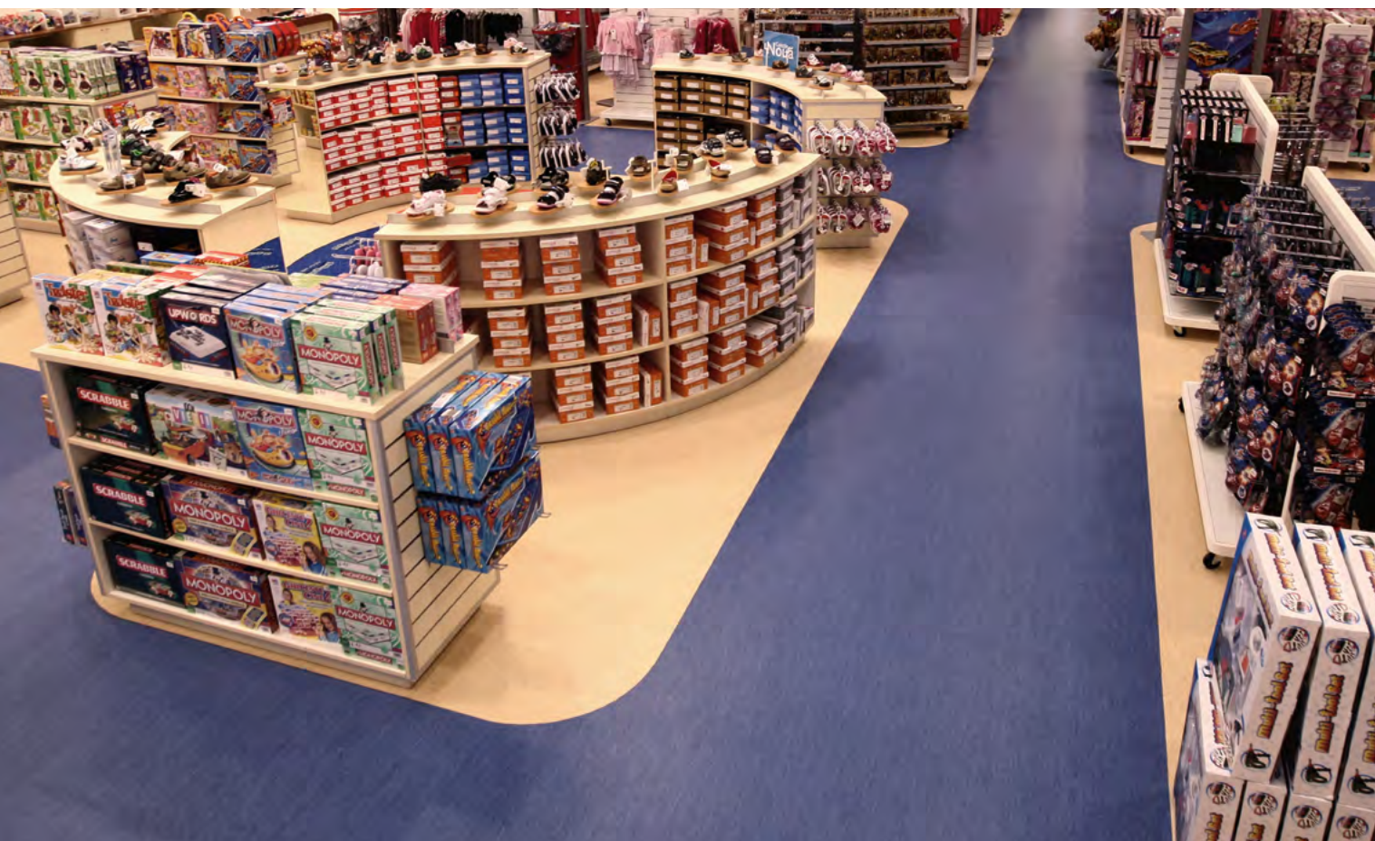
SMYK, Bucharest, Romania, Vinyl – iQ Optima