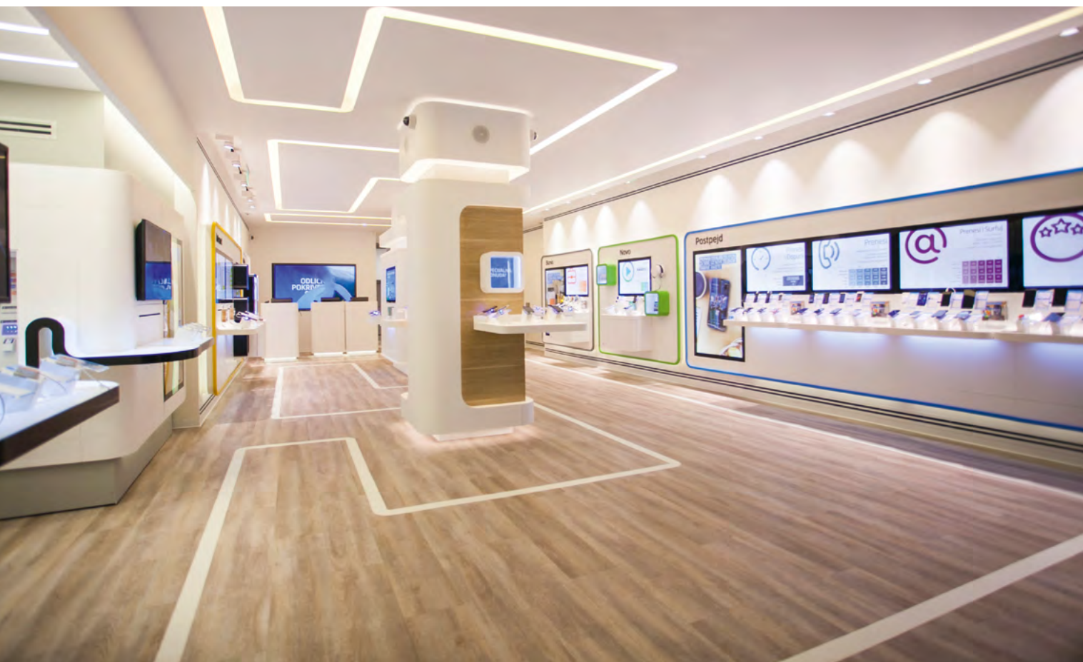
TELENOR, Belgrade, Serbia, LVT – iD Inspiration 70 & 70 Plus