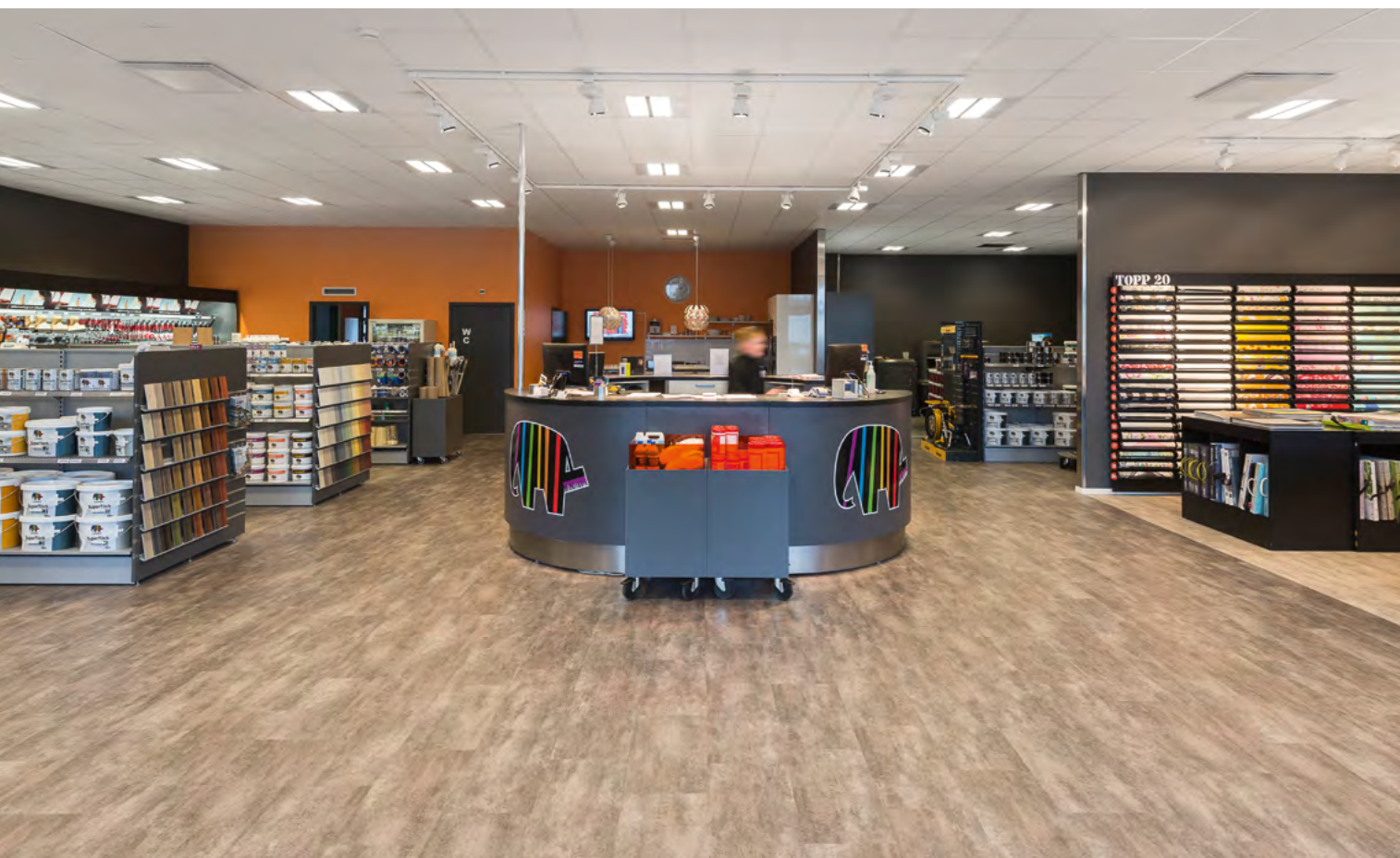
CAPAROL FARG, Vasteras, Sweden, LVT – iD Inspiration 55