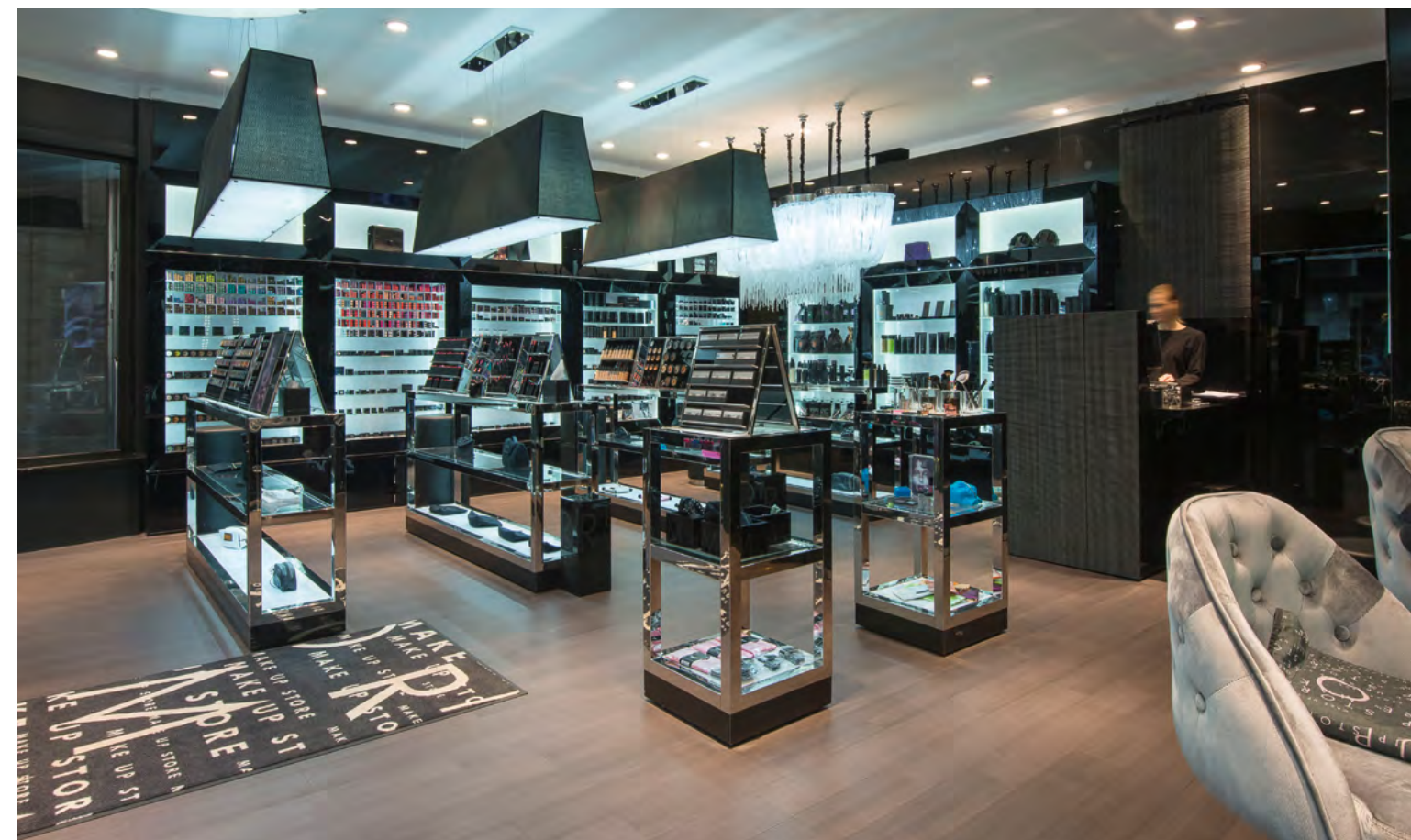
MAKE UP STORE, Stockholm, Sweden, LVT – iD Inspiration 55