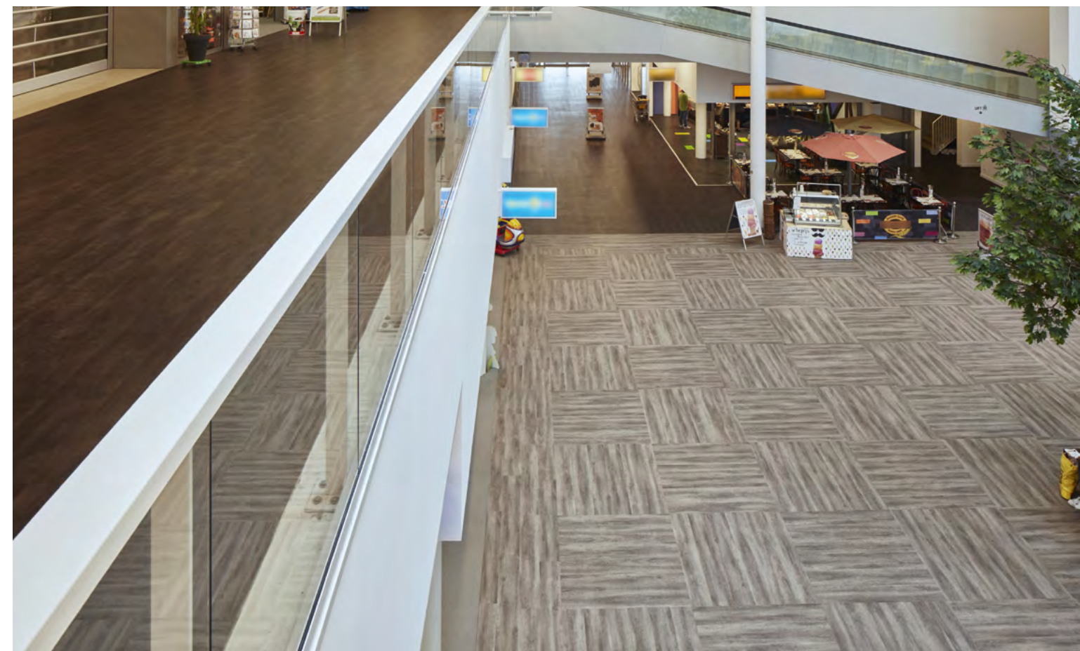
STADA STORES SHOPPING MALL, Breda, Netherlands, LVT – iD Inspiration 70