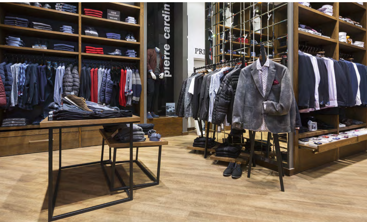
PIERRE CARDIN, Poznan and Lublin, Poland, LVT – iD Inspiration 70