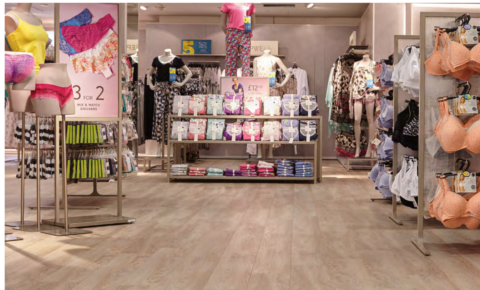
MARKS & SPENCER, Peterborough, UK, LVT – iD Inspiration 70