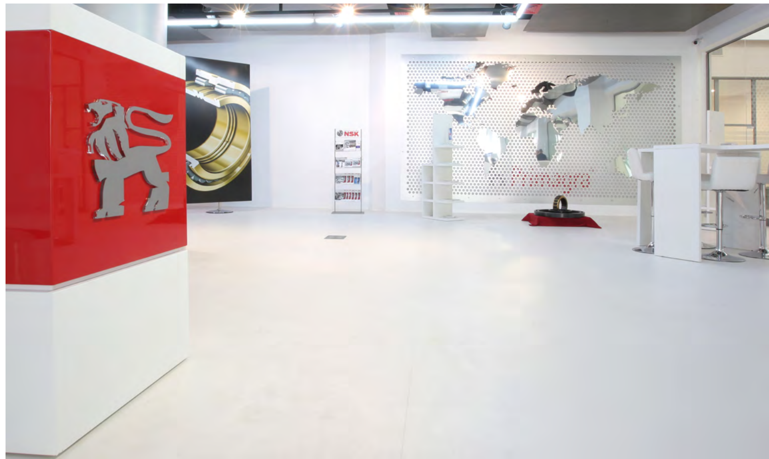
PRIMAGRA CENTRE (PEUGEOT), Suceava, Romania, LVT – iD Inspiration