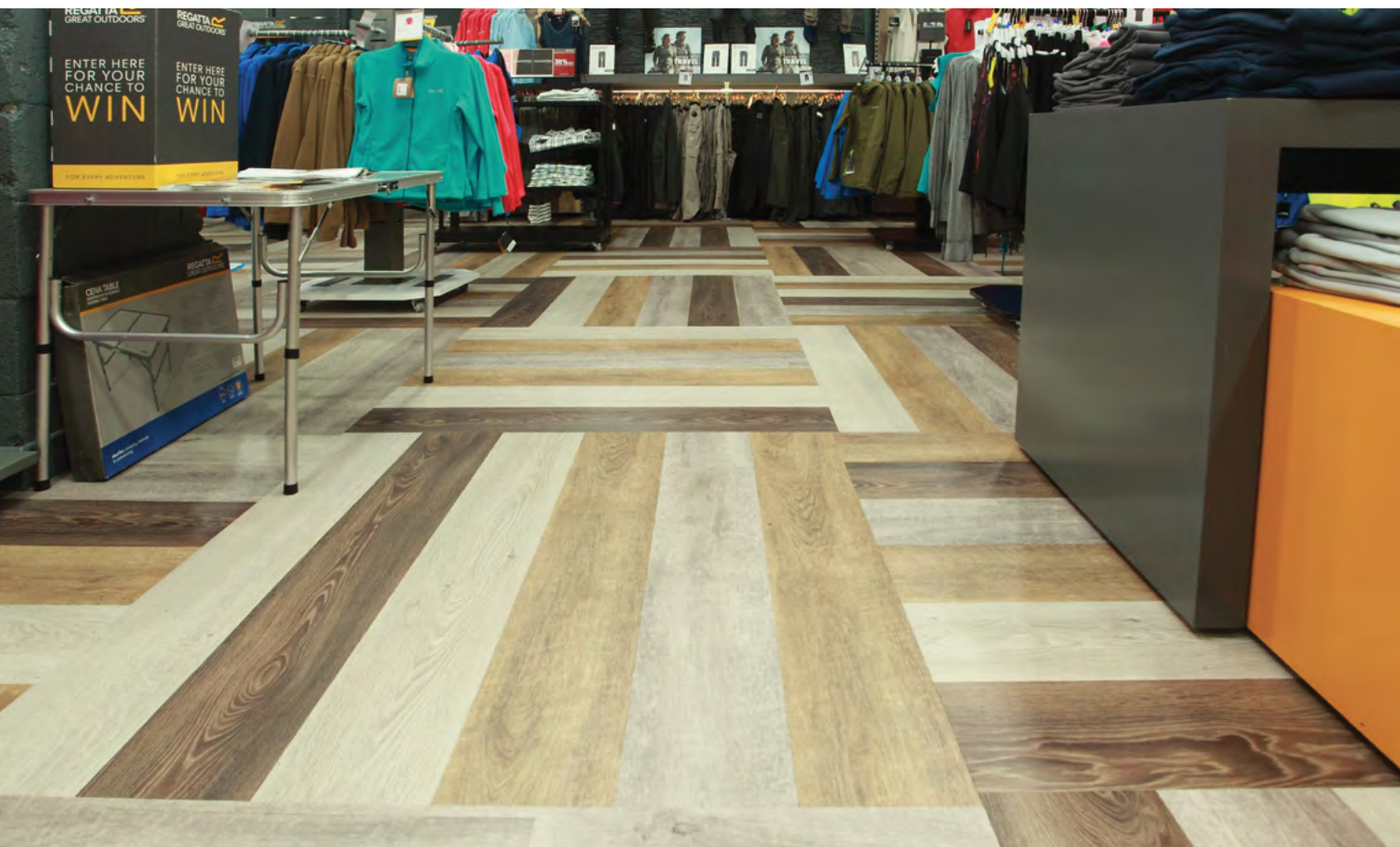
REGATA STORE, Dublin, Ireland, LVT – iD Inspiration 70