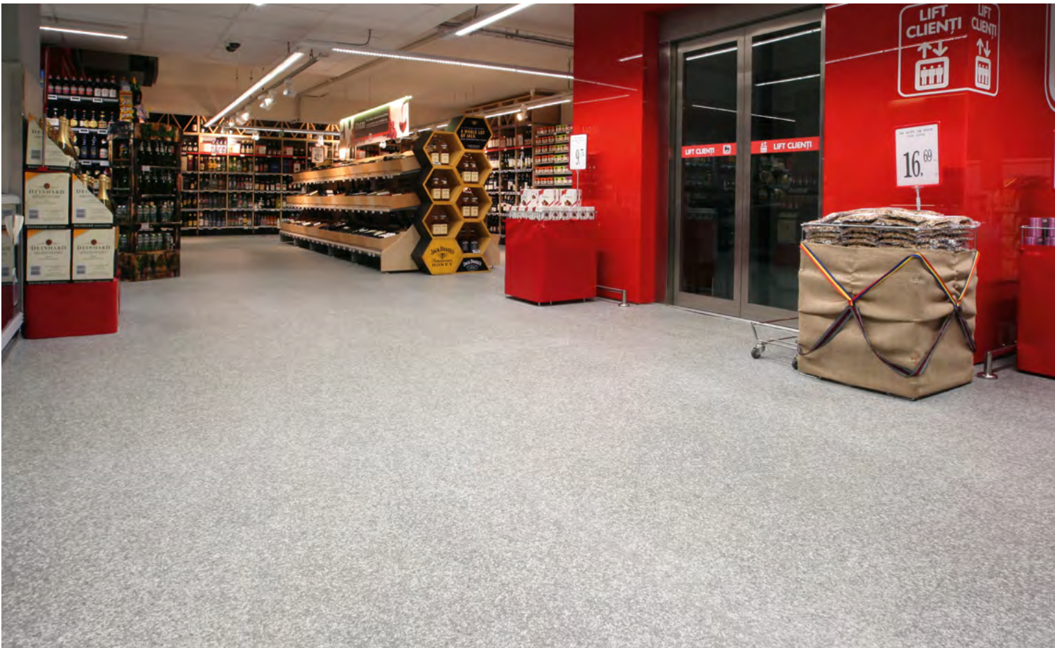
MEGA IMAGE, Bucharest, Romania, Vinyl – Safetred Dimension