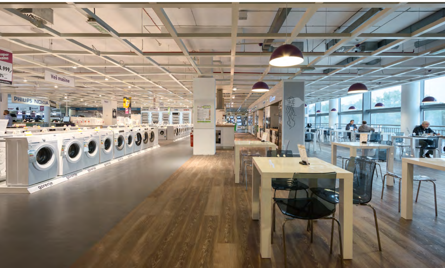
EMMEZETA, Belgrade, Serbia, Orion New, Vinyl – iQ Optima, LVT – iD Inspiration