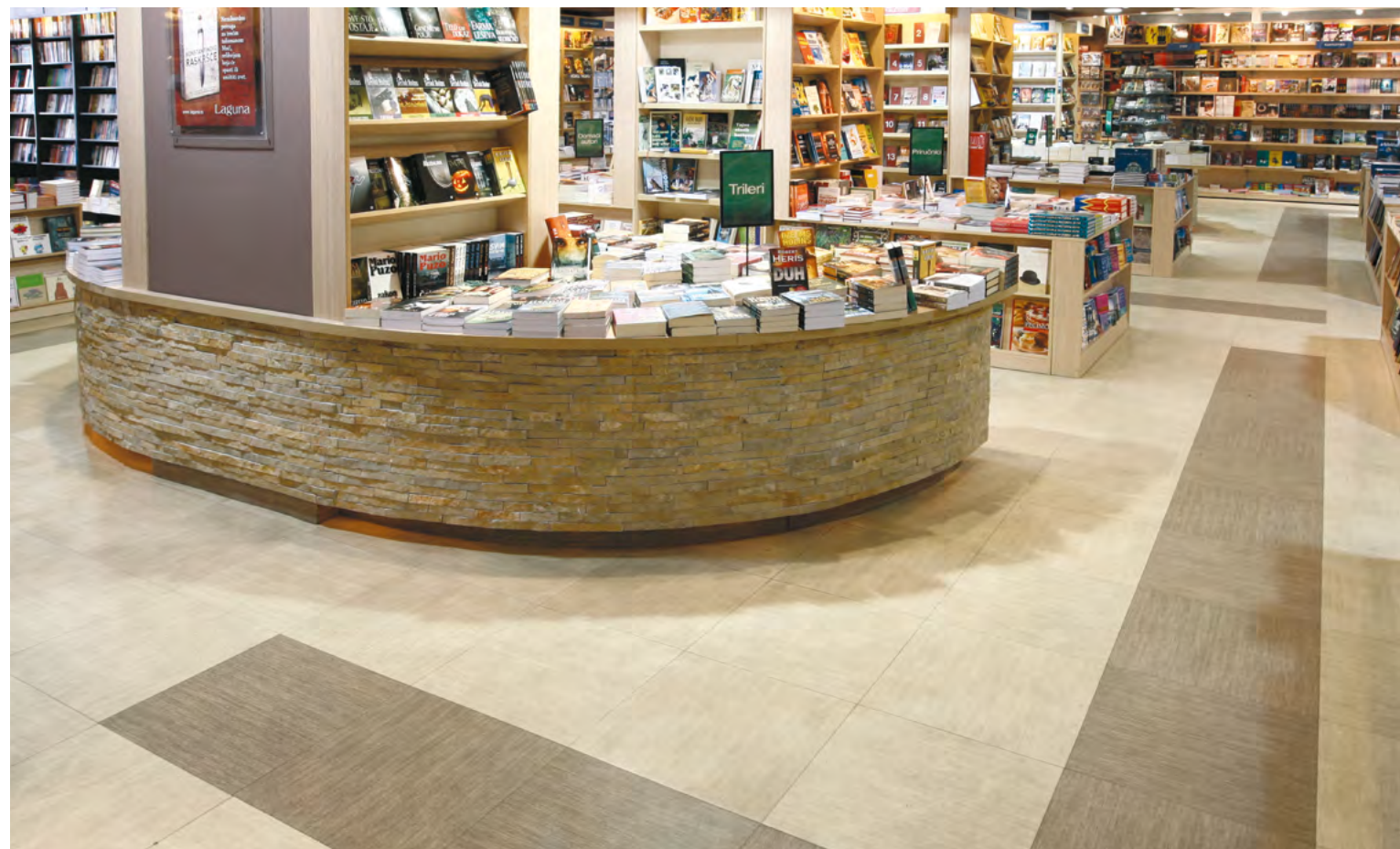
DELFI, Belgrade, Serbia, LVT – iD Square