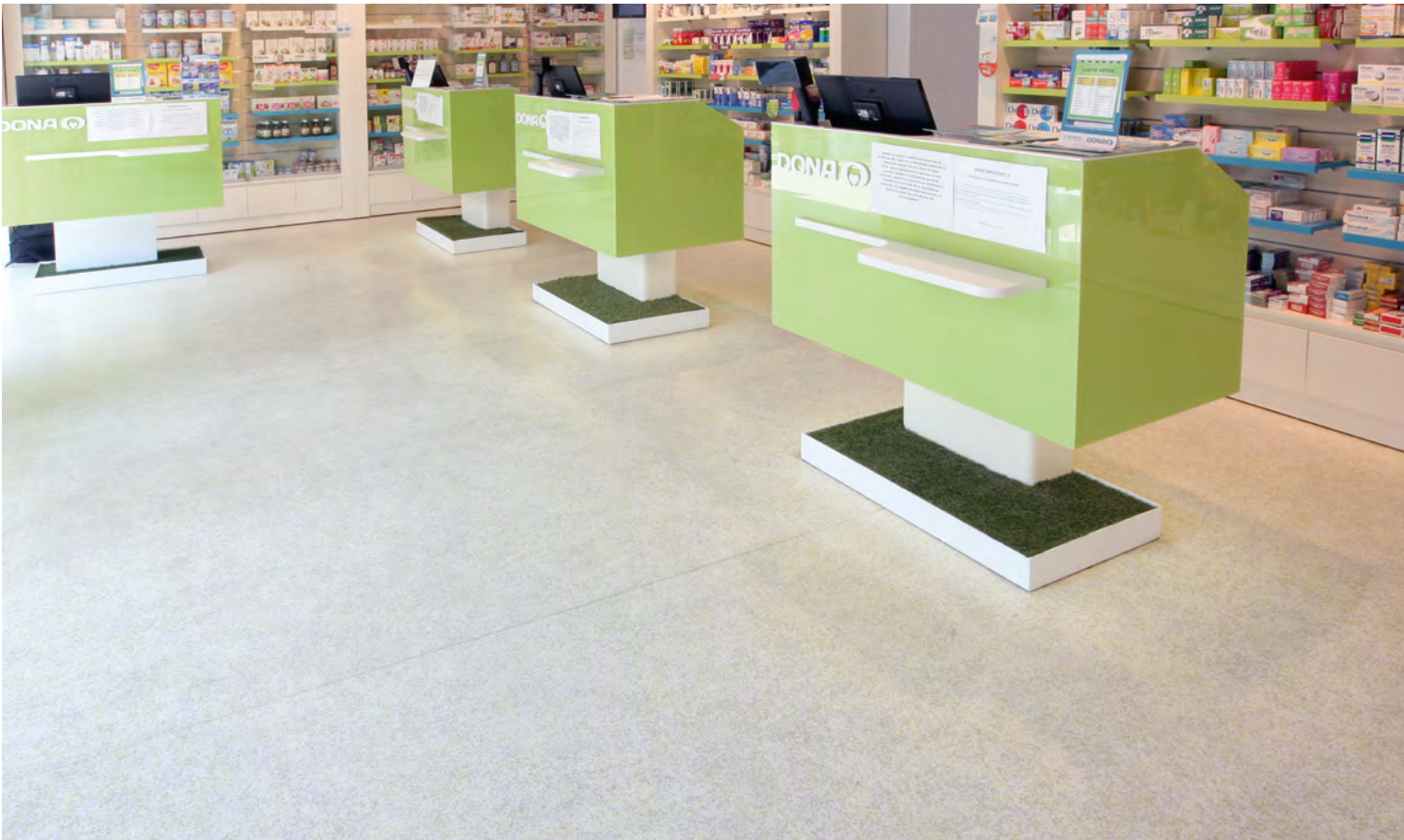
DONA PHARMACY, Bucharest, Romania, Vinyl – Acczent Excellence 80