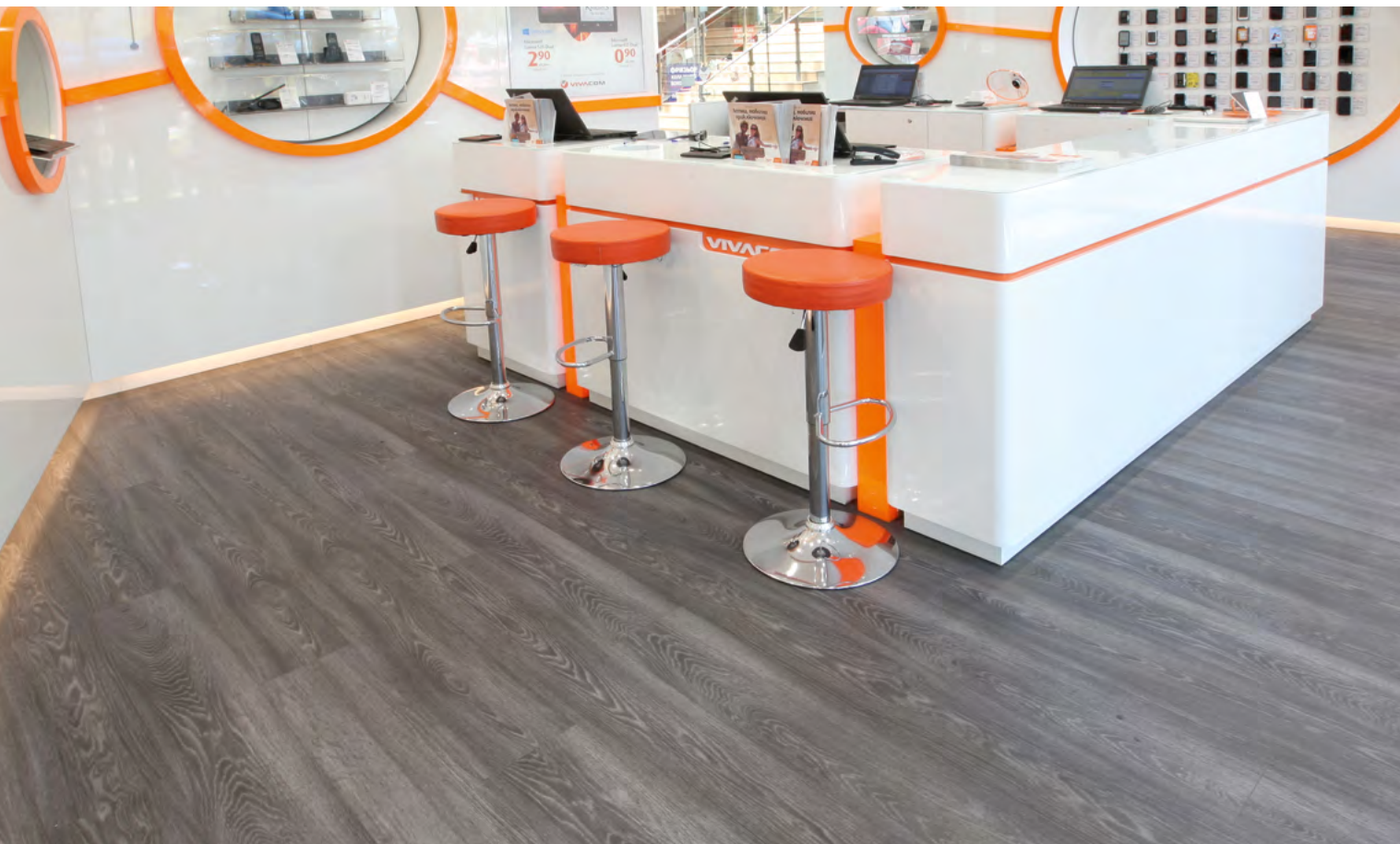
VIVACOM, Sofia, Bulgaria, LVT – iD Inspiration 55