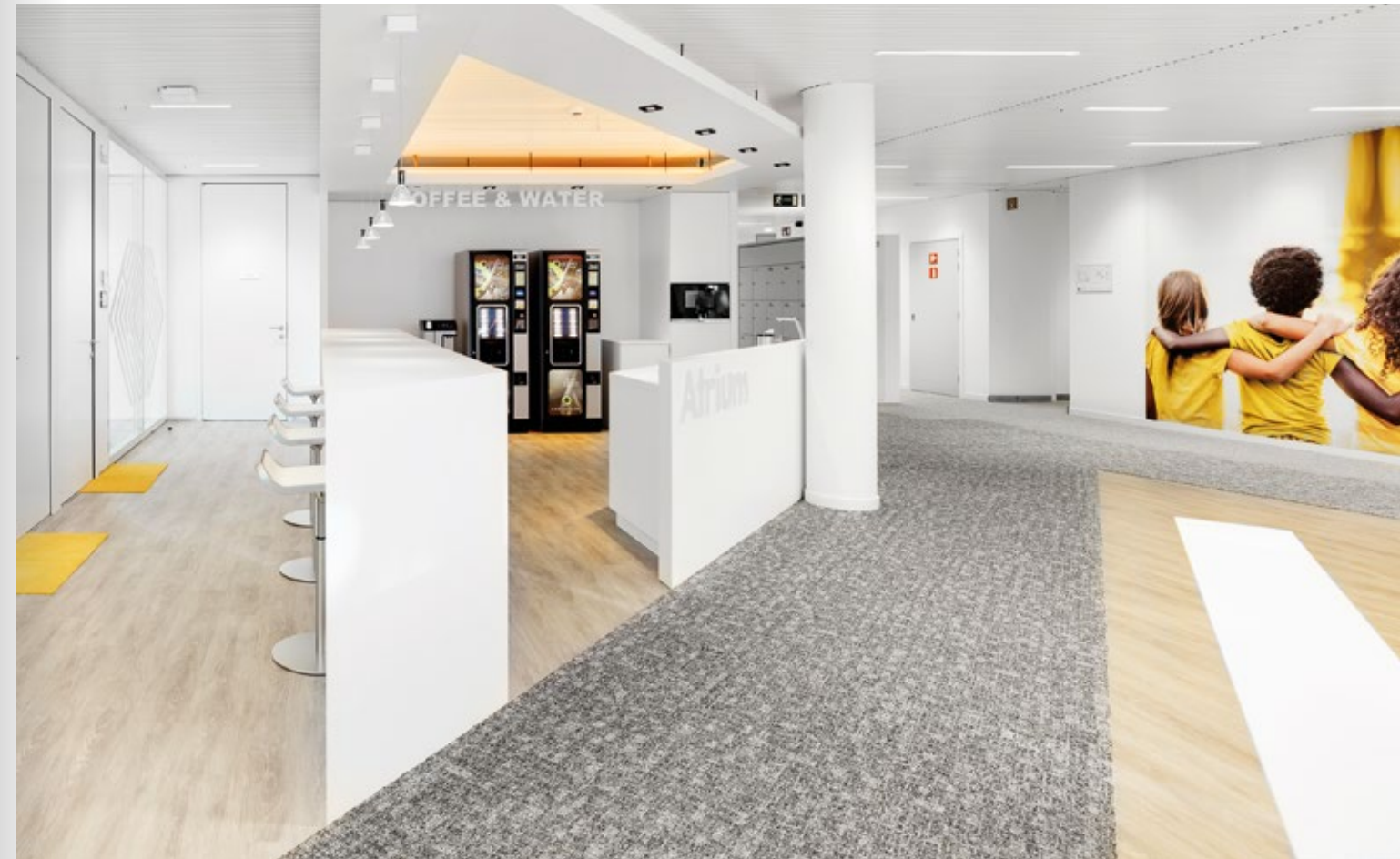
AXA, Brussels, Belgium, Desso Fields Palatino Tweed