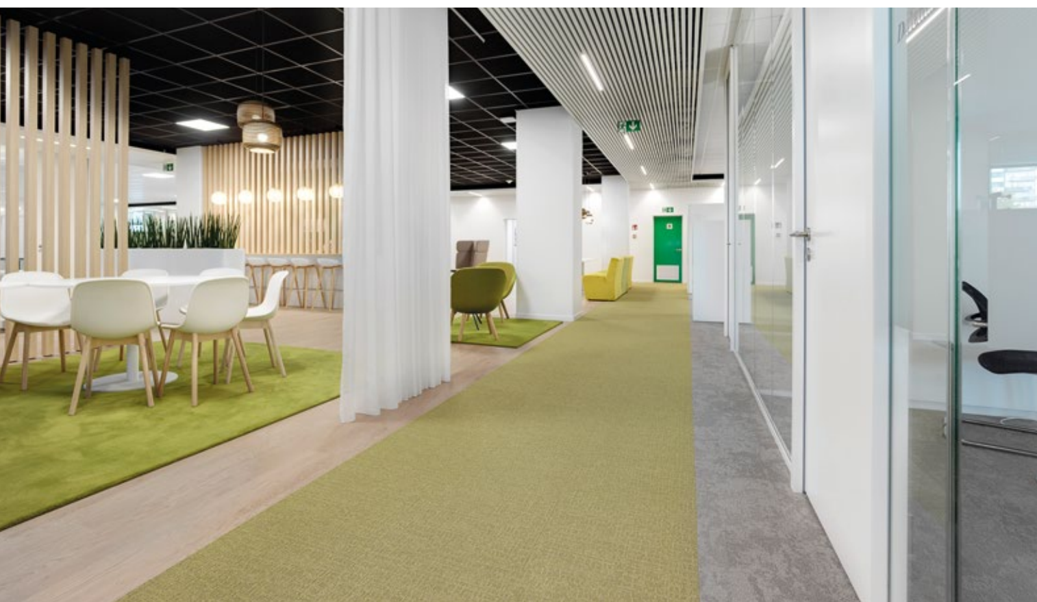
Partena Promeris, Brussels, Belgium, Airmaster Atos, Airmaster Sphere, Desert Airmaster, Textile Desso