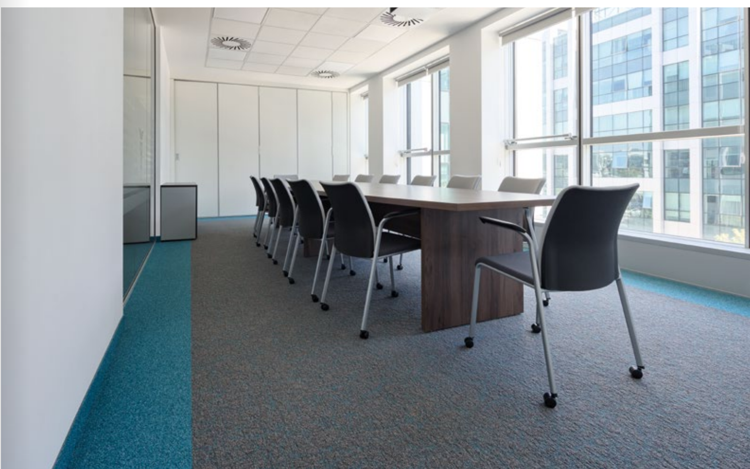
Worldwide Clinical Trials, Belgrade, Serbia, Textile tiles Desso Essence, Salt & Rock