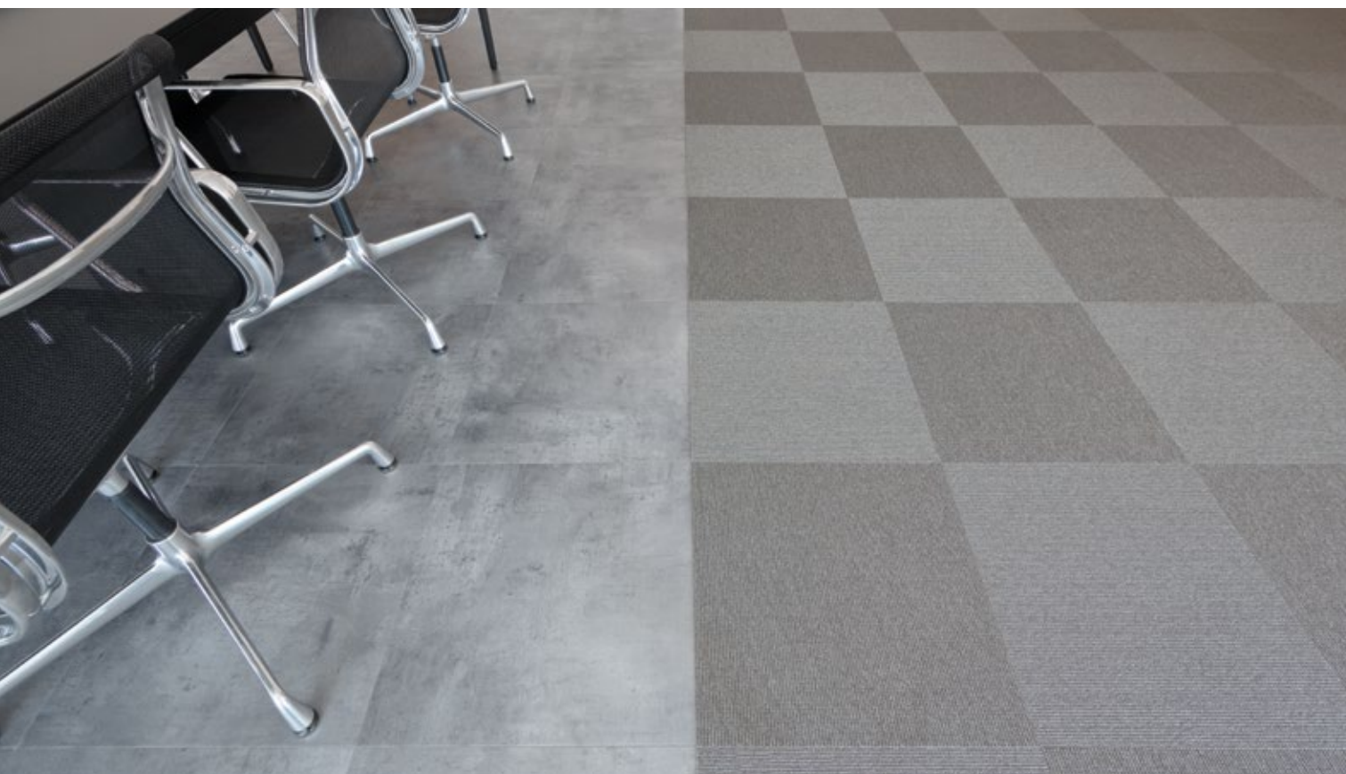
DBA, Novi Sad, Serbia, Parquet Salsa Natur, Textile tiles Sky, LVT iD Inspiration 70