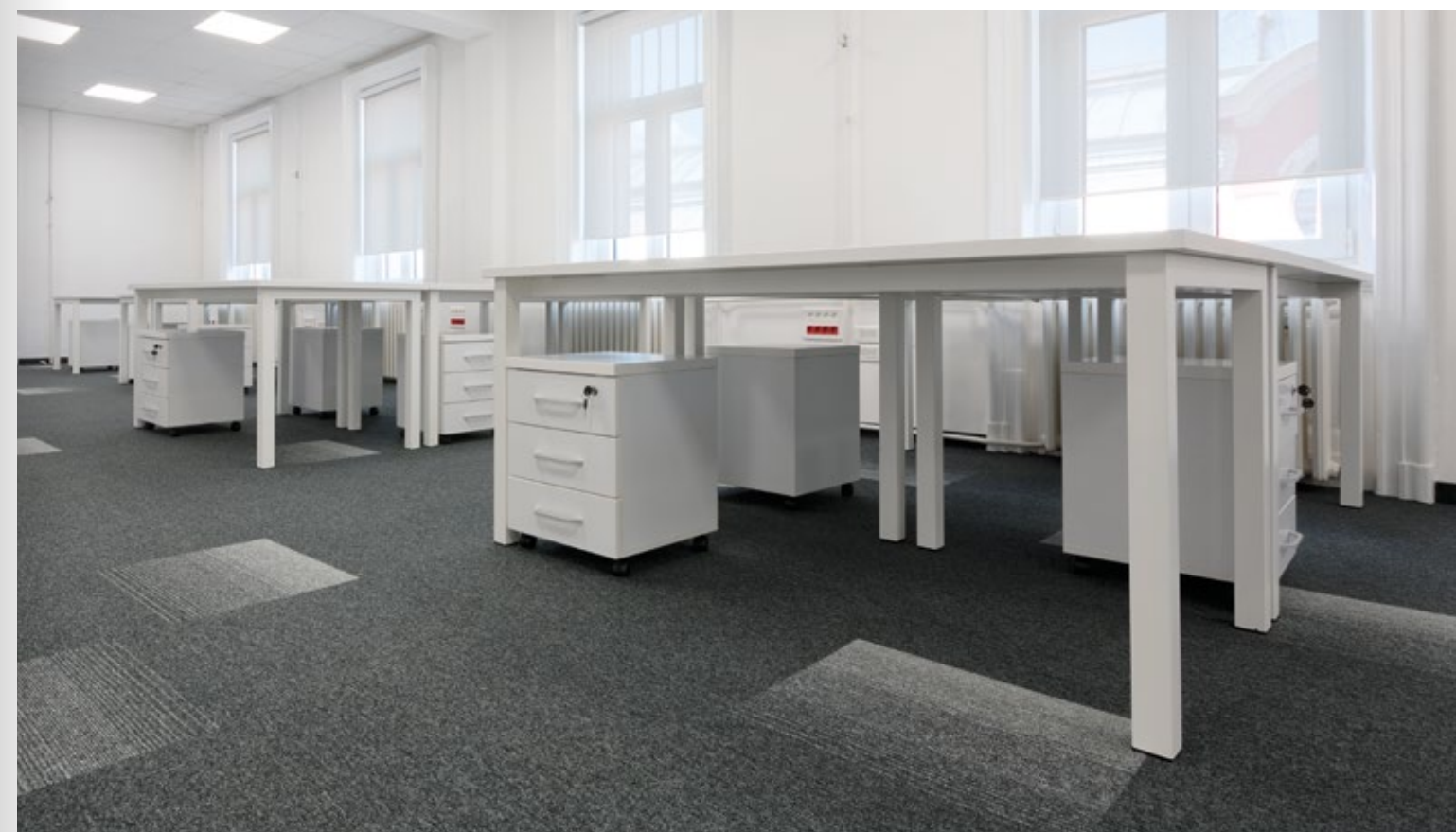
NTT Data, Novi Sad, Serbia, Textile tiles SKY