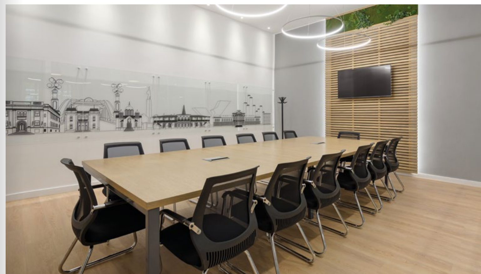
SCGM, Kragujevac, Serbia, LVT Starfloor Click 55 – Modern Oak