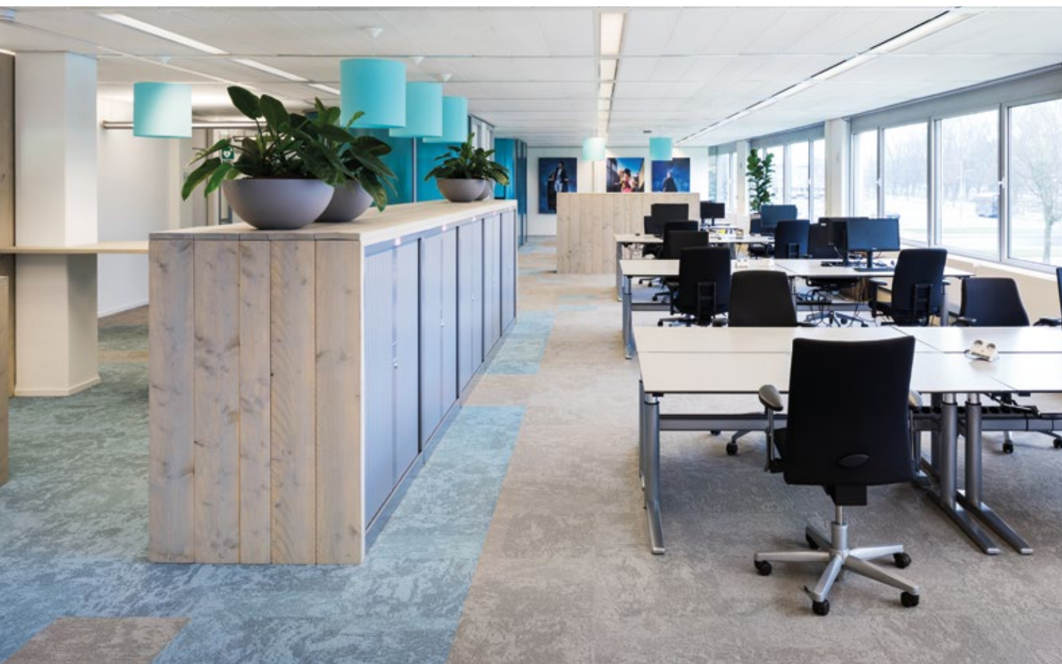
Municipality of Breda, The Netherlands, Airmaster Sphere, Desert Airmaster, Rock, Textile Desso