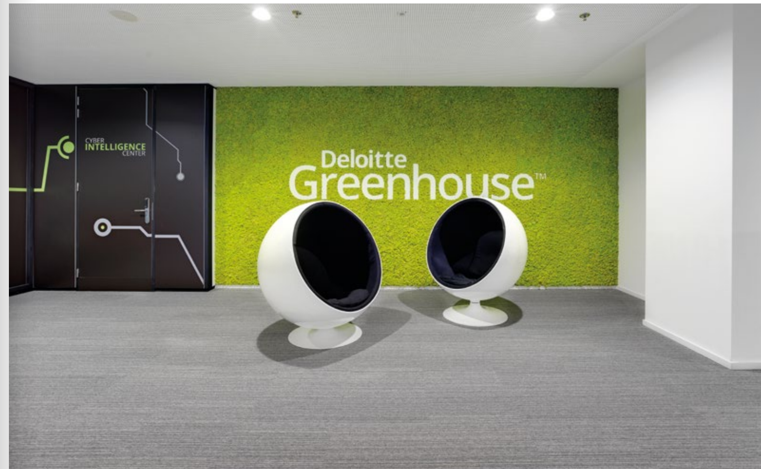
Deloitte, Zaventem, Belgium, Desso Essence Stripe Palatino