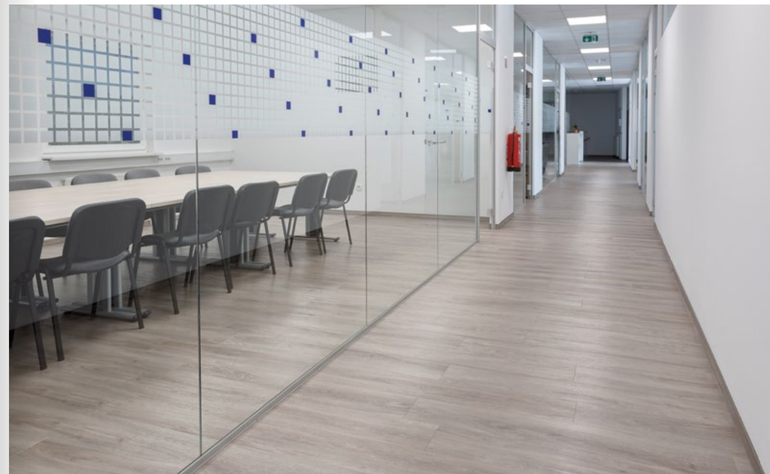
Petrans, Ljubljana, Slovenia, LVT iD Inspiration 55