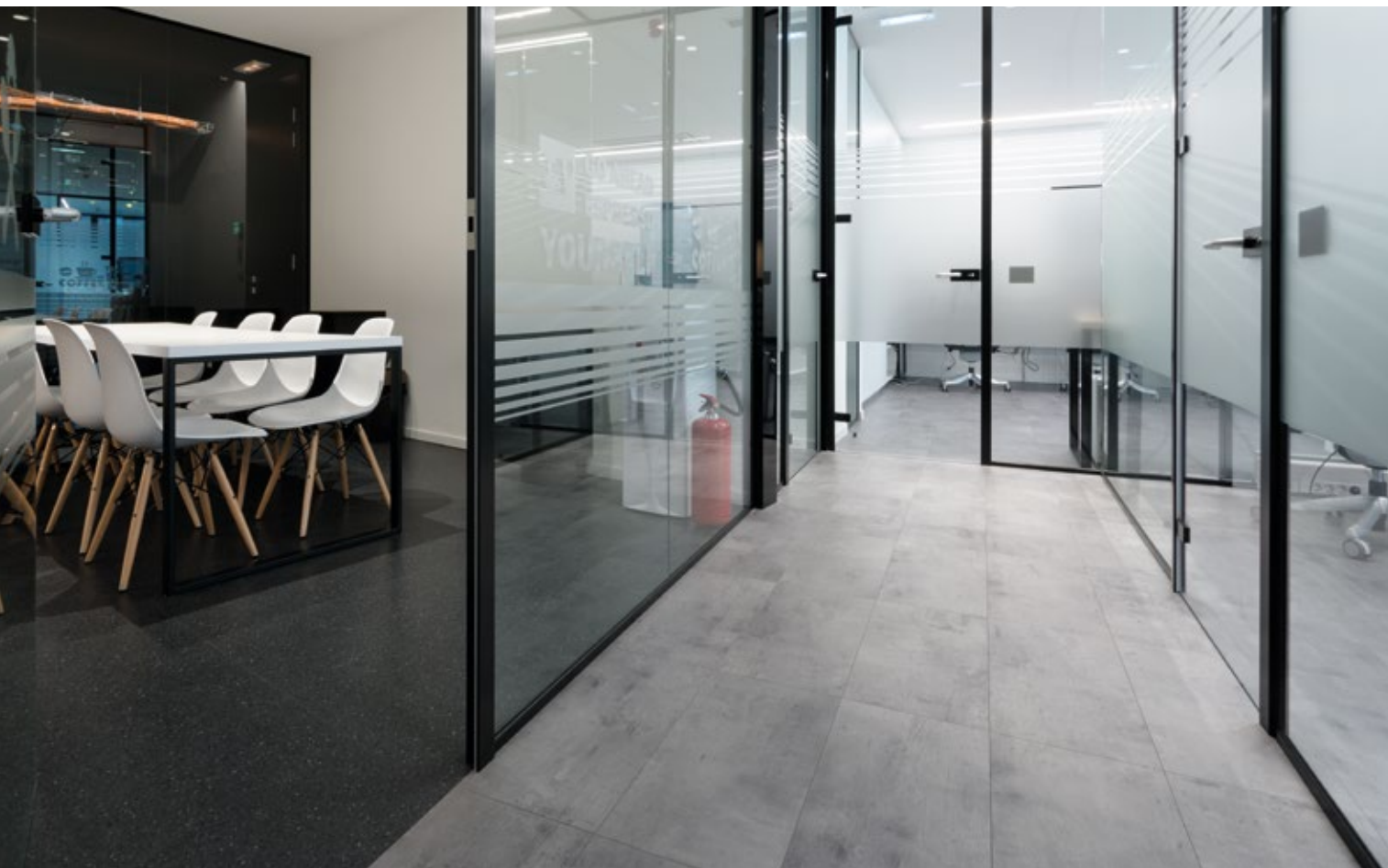
FSD, Novi Sad, Serbia, LVT iD Inspiration 70 – Vintage Zinc