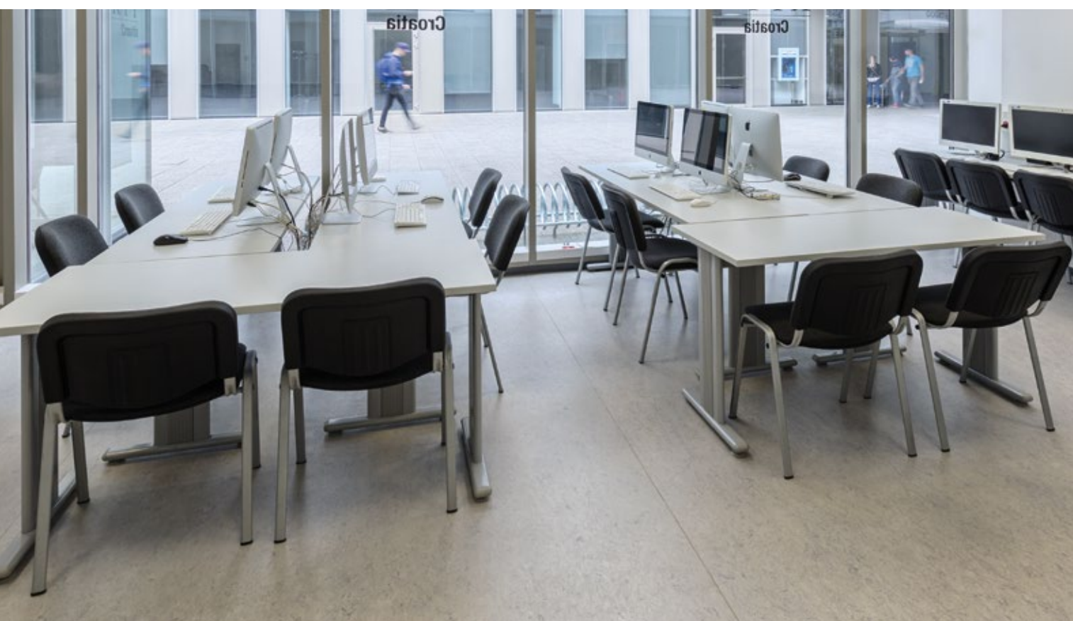
Rochester Institute of Technology (RIT), Zagreb, Croatia, Linoleum Veneto xf2™ 2.5 mm