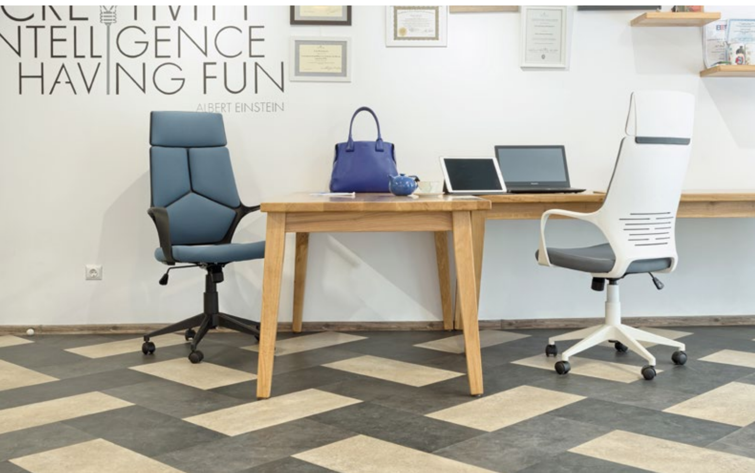
NLP office, Sofia, Bulgaria, LVT iD Essential 30