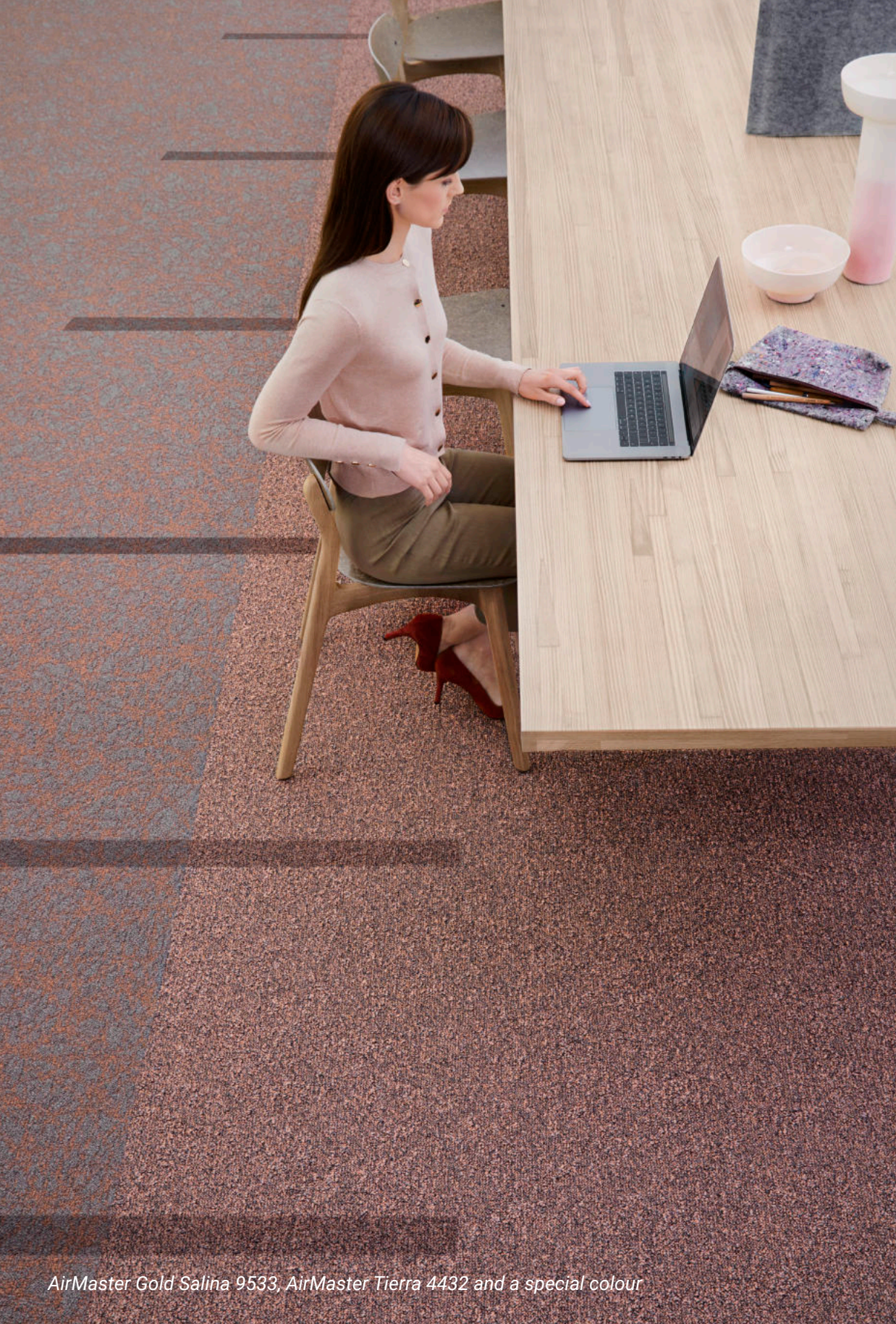
AirMaster Gold Salina 9533, AirMaster Tierra 4432 and a special colour