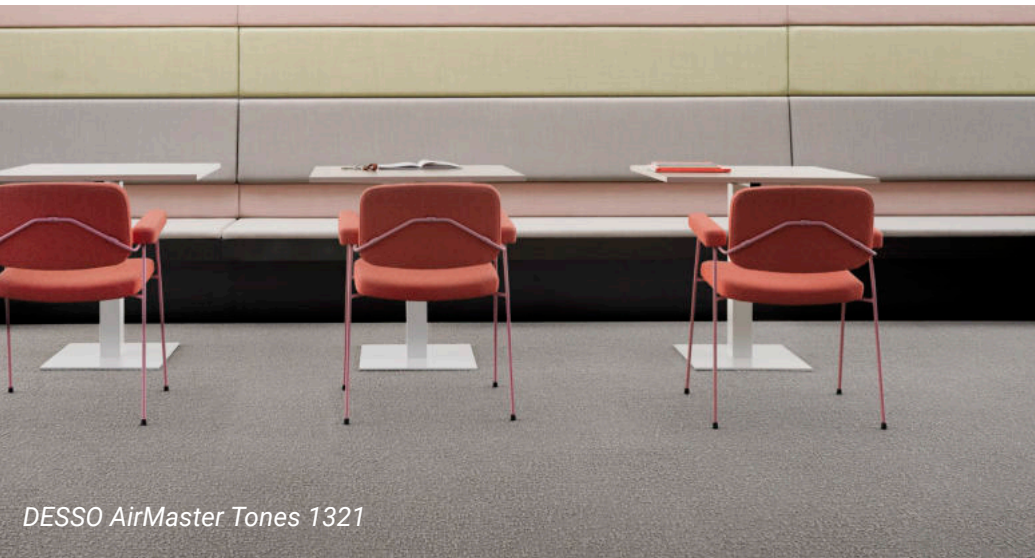
DESSO AirMaster Tones 1321