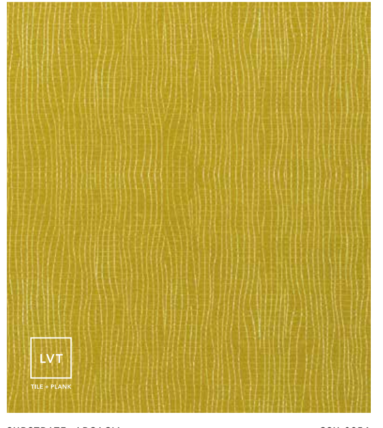
VENUE ABSTRACT, MORTAR