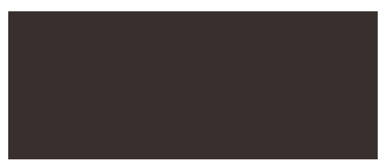
BLACK PEARL 00082*