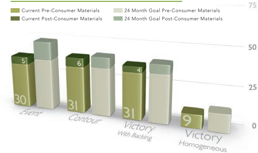
Recycled Content in Tandus Centiva LVT (percent)

All Tandus Centiva LVT can be recycled over and over again. This is possible with the use of superior raw materials which means our products retain exceptional performance even after reprocessing. Through our recovery process, our flooring can be reclaimed and made into new products after its usefulness has ended. Tandus Centiva products are designed to have a continual life cycle.