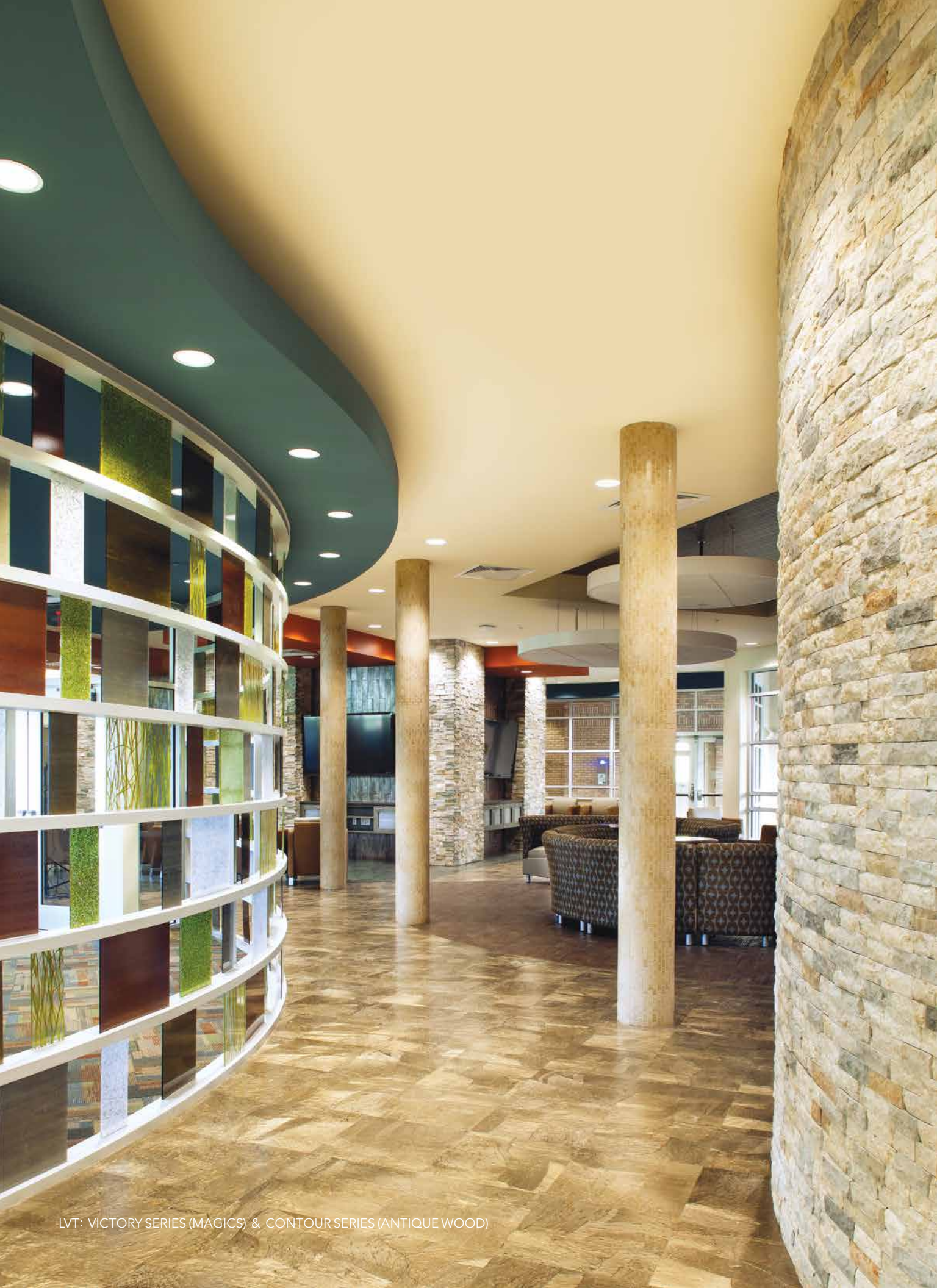
LVT: VICTORY SERIES (MAGICS) & CONTOUR SERIES (ANTIQUE WOOD)