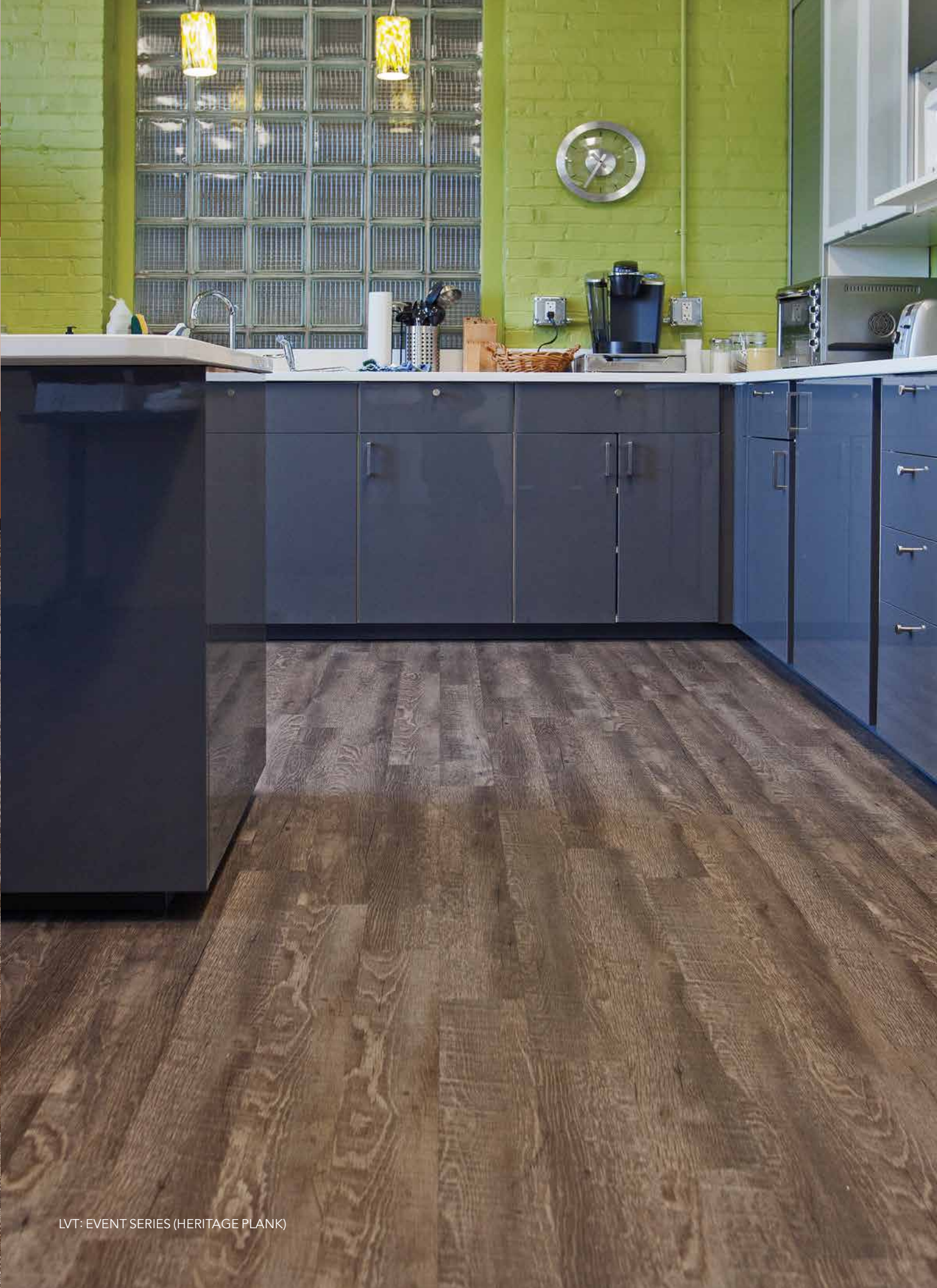
LVT: EVENT SERIES (HERITAGE PLANK)