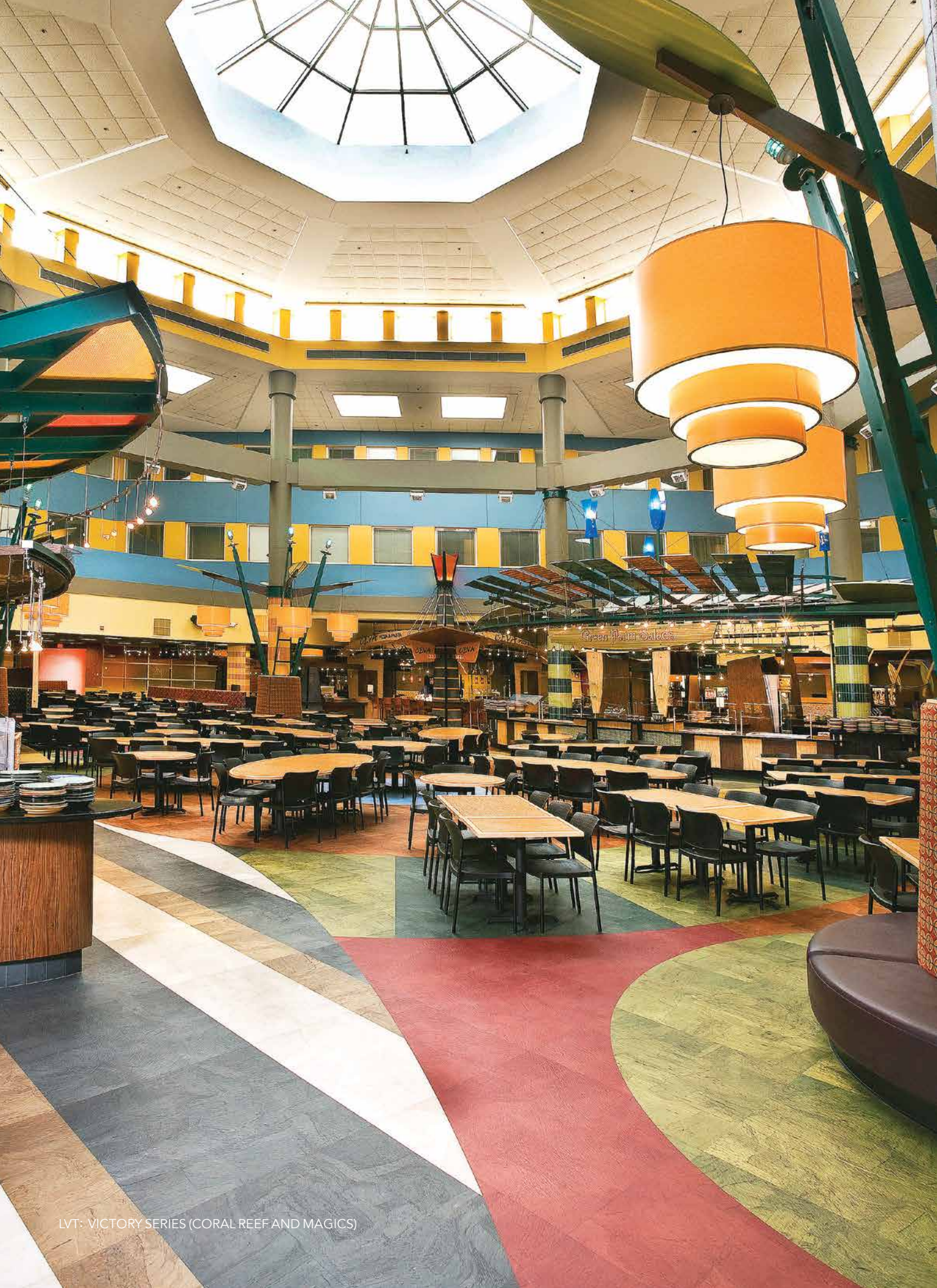
LVT: VICTORY SERIES (CORAL REEF AND MAGICS)