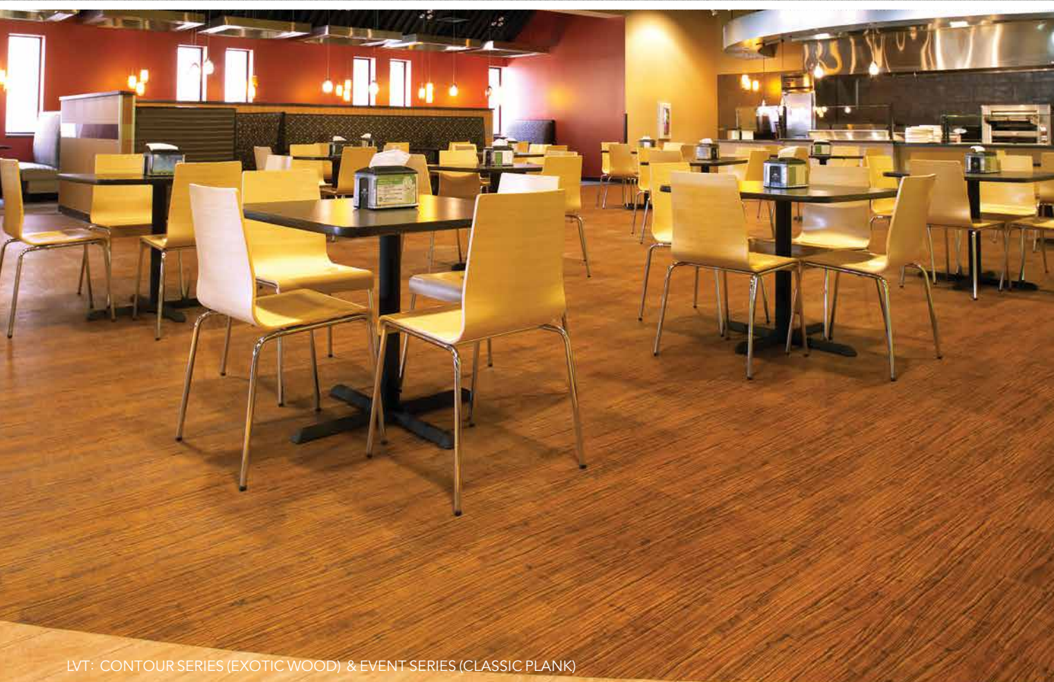
LVT: CONTOUR SERIES (EXOTIC WOOD) & EVENT SERIES (CLASSIC PLANK)