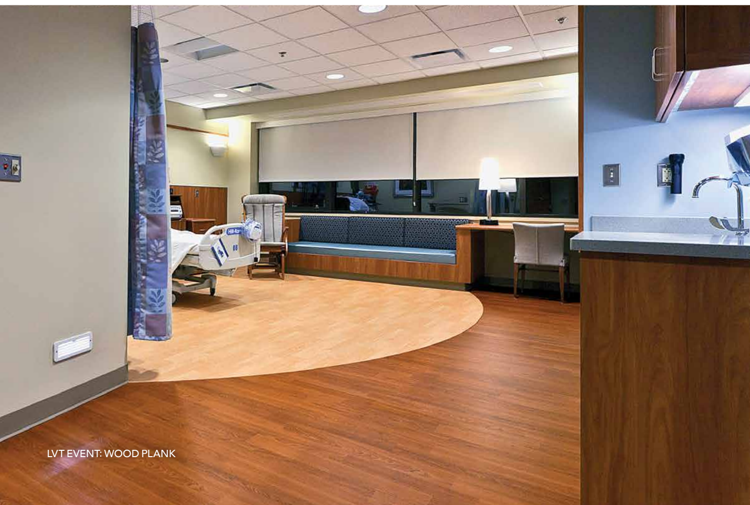
LVT EVENT: WOOD PLANK