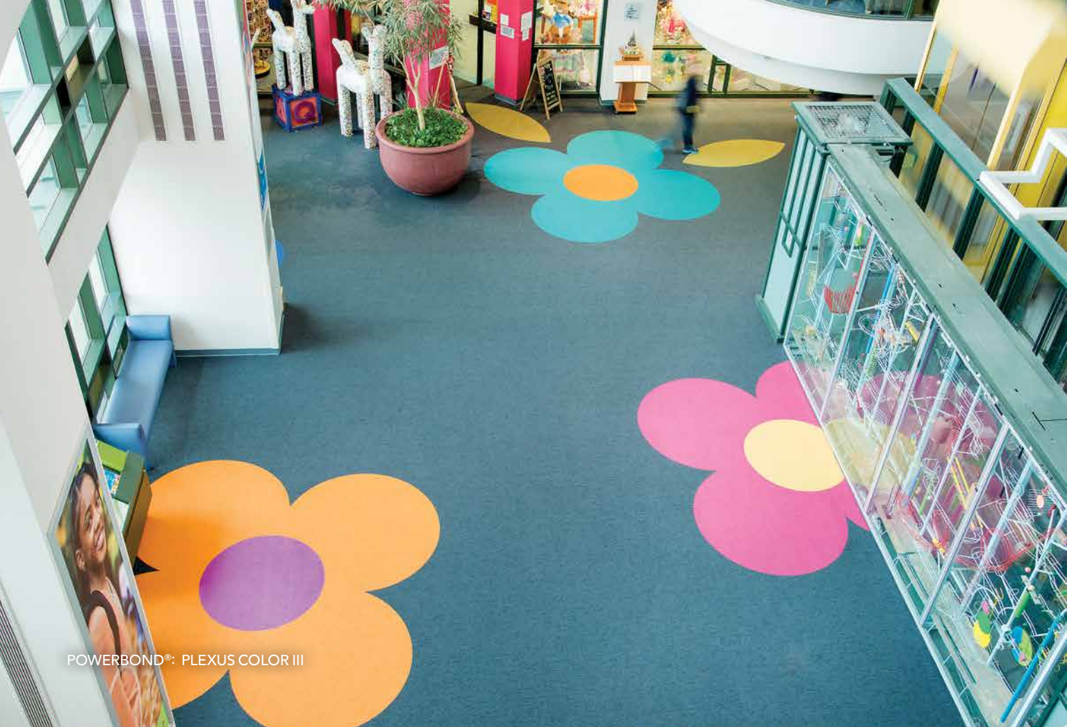
POWERBOND®: PLEXUS COLOR III